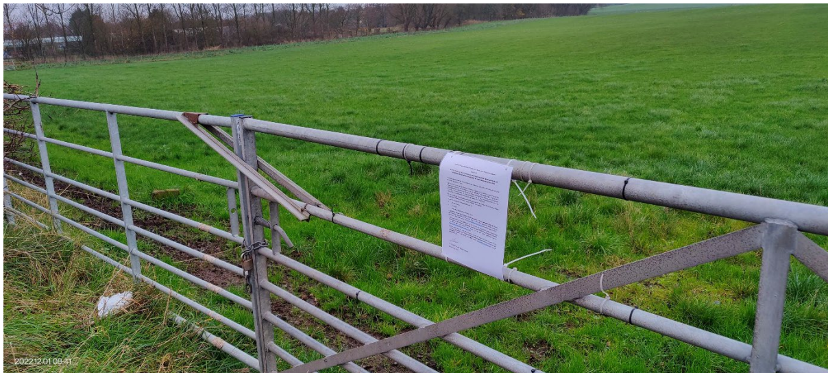
Gate at property