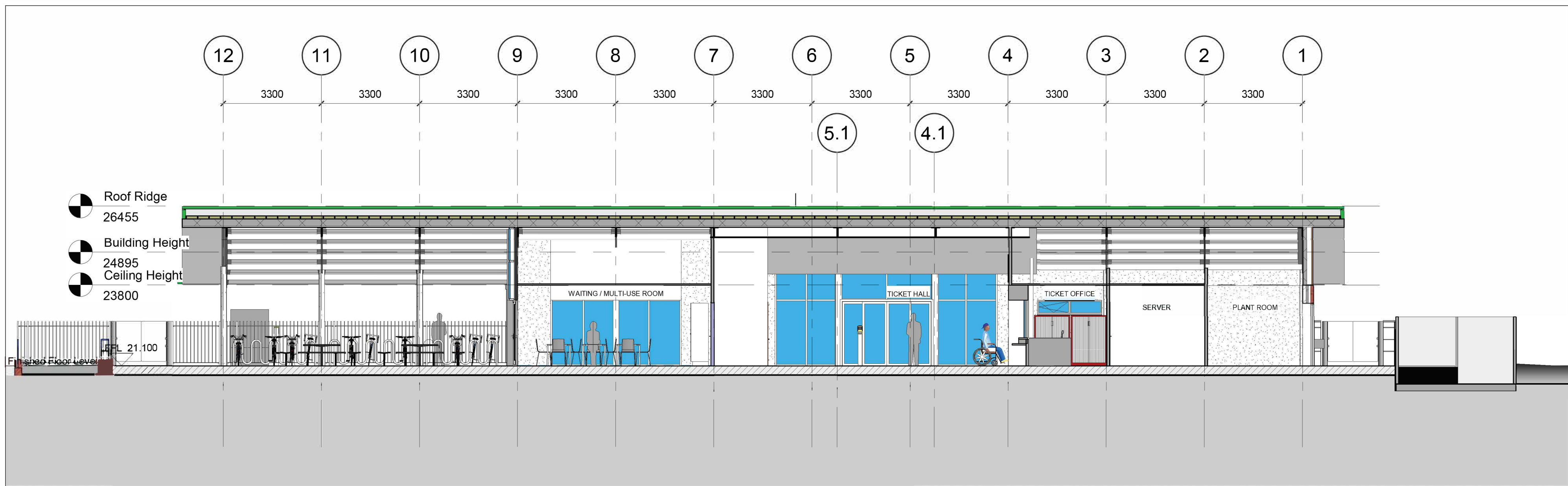
3 Section B-B 1 : 100