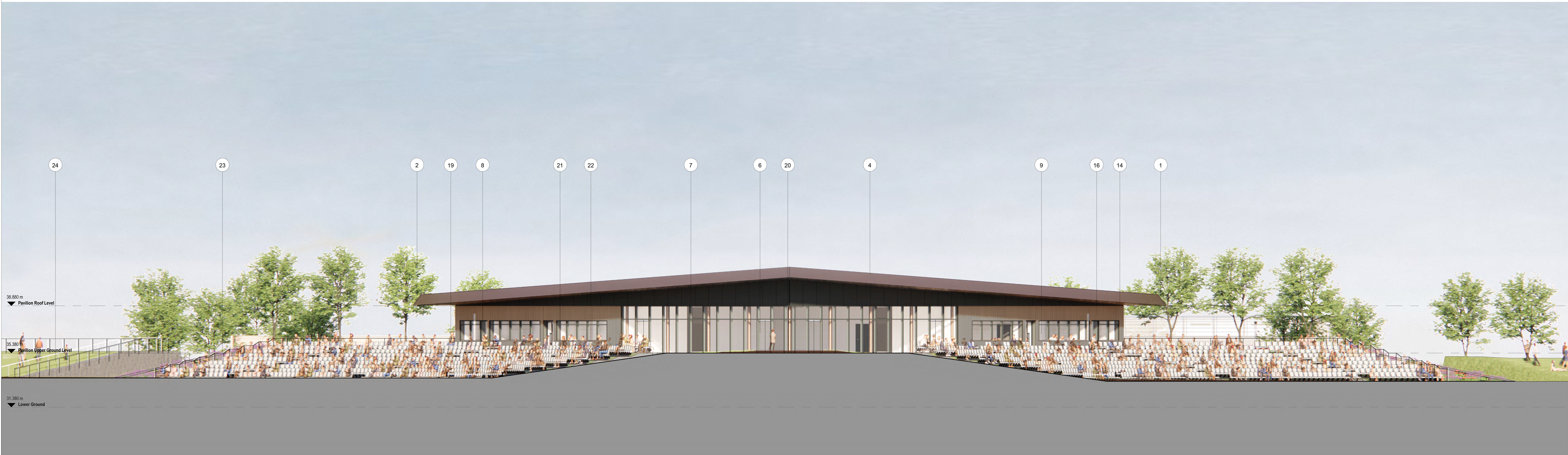
East Elevation 1 : 100