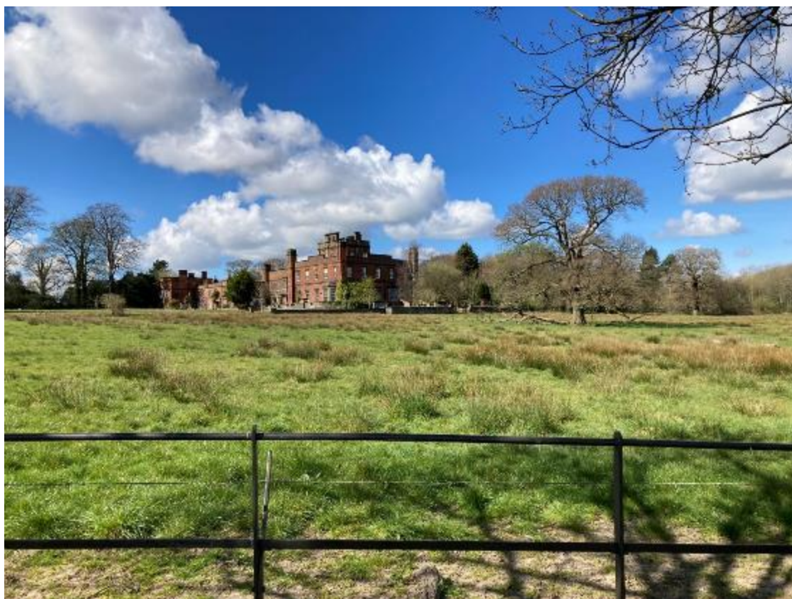
Plate 10: Cuerden Hall from the south-east from Cuerden Valley Park