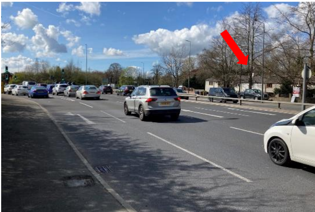
Plate 6: Crow Tree Cottages fronting onto A582 interchange (facing north-west from the Old School Road junction)

4.2.5 Also shown on the 1848 OS map, Banatres at Bank (OA 11; LHER 36144) of Higher Green remains extant. It is a former farmstead on Nook Lane, including a modernised house and at least two brick-built barns of some antiquity. However, it functions as a scrapyards and is surrounded by modern industrial estates and infrastructure. The M65 embankment (and overhead powerlines along its line) define the plot to its south (Plate 7) and to the immediate north of Nook Lane (now a dead end) is the B&Q warehouse accessed from the A6. Whilst being immediately adjacent to the Site, it is separated from it by the M65 which has high, wide embankments, and its present setting and modern business use has severely compromised its significance.