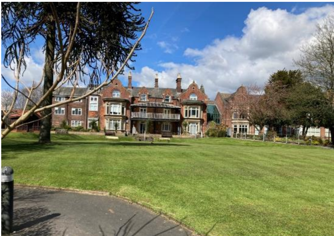
Plate 8: St Catherine's Hospice main south-facing façade and lawn