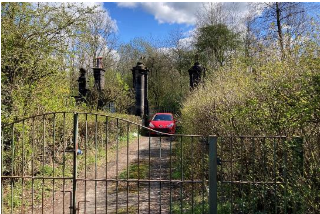
Plate 12: Stag Lodge Gate from Wigan Road junction, facing east