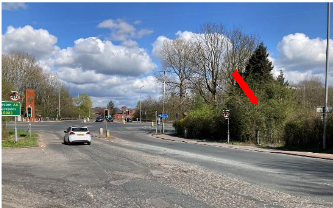
Plate 11: A6/A49 road junction, with Old Lostock Lane to left and Stag Lodge gates to right (marked by an arrow)

surmounted by pedestals originally bearing a stag and a hawk in moulded stucco (now degraded). The classically-derived ashlar lodge is small and flat-roofed formed on one side by the gateway wall and with one central chimney (Plate 12).