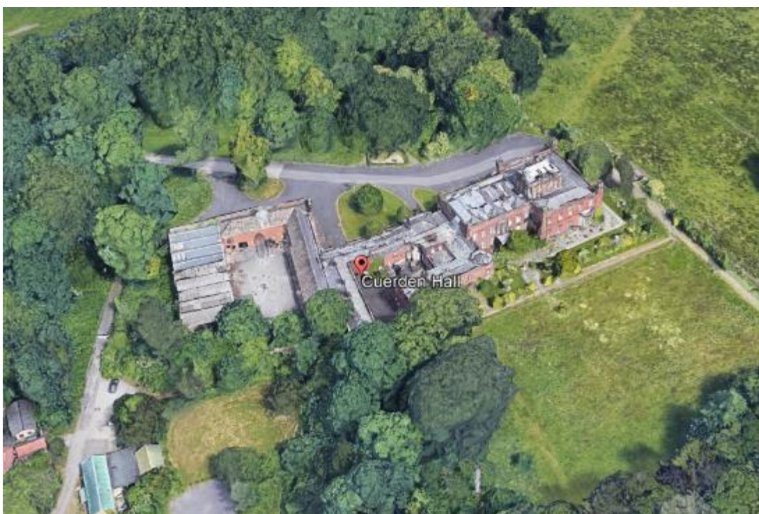
Plate 4: Aerial view of Cuerden Hall OA 4 and Stables OA5