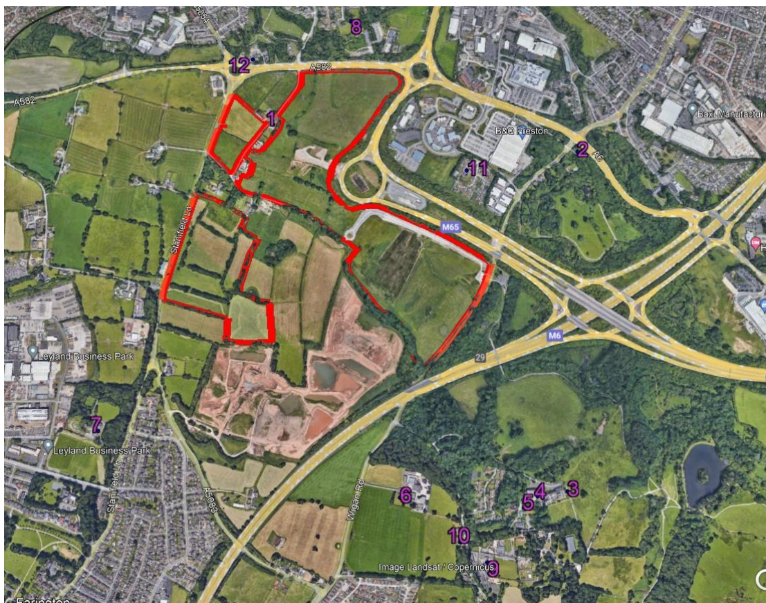
Plate 1: The Site and its surroundings and the 1km study area

1.2.1 The Site is located c 4.1km south of Preston city centre (Fig 1) and is allocated in the South Ribble Local Plan under C4 as a 'Strategic Site'. It is bound to the north-west by the Farington Road/Lostock Lane and Stanifield Lane roundabout, to the north by the Lostock Lane (A582), and to the north-east by the Lostock Lane and the A6 roundabout (Plate 1). The north-eastern boundary is formed by the A6 dual carriageway which leads to a junction 1A of the M65 which itself forms the remainder of the northern site boundary. The eastern boundary of the Site lies adjacent to Wigan Road (A49). Agricultural fields and an operational quarry form the southern boundary, and Stanifield Lane spans the entire western boundary of the Site.