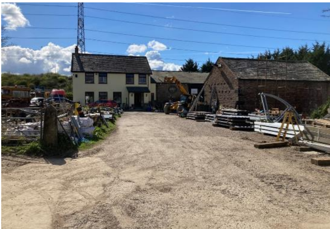
Plate 7: Former farmstead, Banatres at Bank (OA 11; LHER 36144)