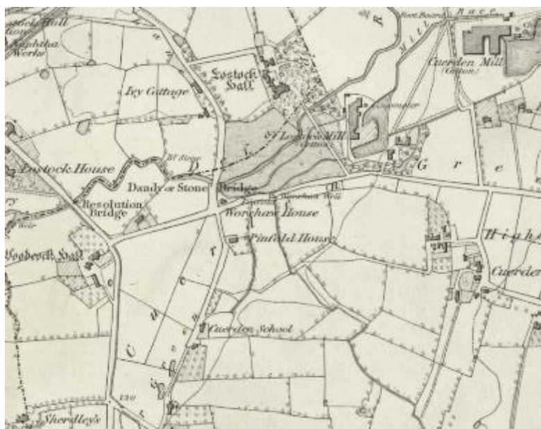
Plate 3: Excerpt of the first edition OS map of 1848 showing the Cuerden Green area

3.2.6 Further east on Nook Lane, one building recorded as Banatres at Bank (LHER 36144) of Higher Green/Cuerden Nook remains extant. It is a former farmstead but now surrounded by modern industrial estates, and functions as a scrapyards (LHER 36144; Section 3.3.5 ).