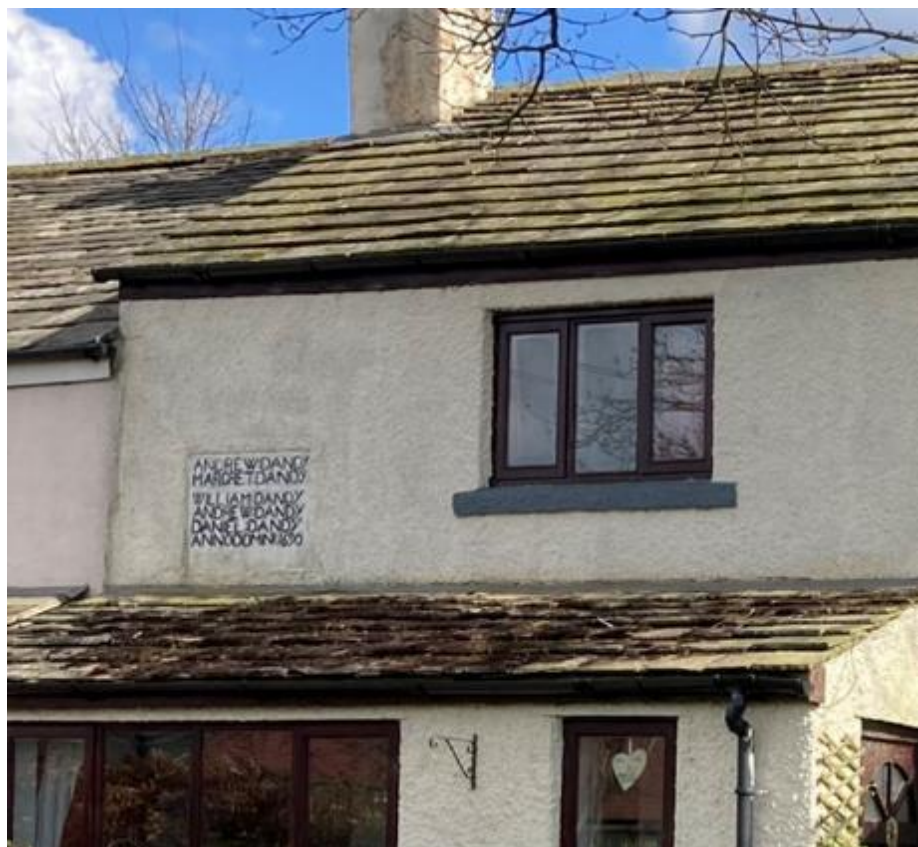
Plate 2: Detail of the 1690 datestone on the Old School House (OA 1)