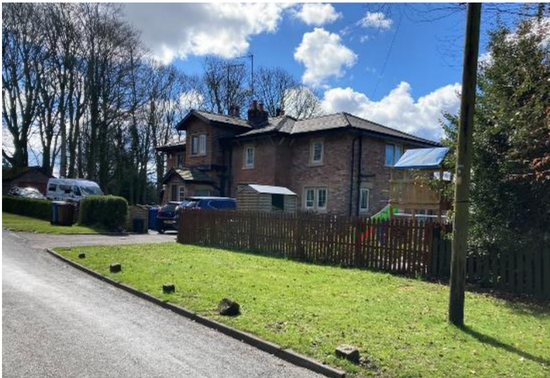
Plate 13: Rose Cottages, Shady Lane, facing south-west (OA 10)

maintenance. The area is quiet and rural and there is no visibility of the development area from Shady Lane, which is tree-lined access from the (A49) Wigan Road, extensive woodland, the high M6 embankment and A49. There is a thick belt of woodland shielding visibility of the M6 motorway to the north-west, and the landscape beyond.