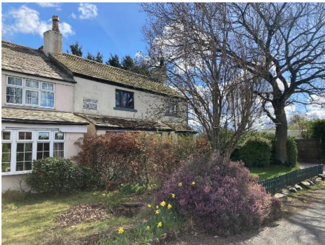
Plate 5: Old School House (OA 1), Old School Road, facing south west

and hedging to the west will provide some shielding during the construction and operational phases, but development to the west will impact the setting of the grade II listed building.