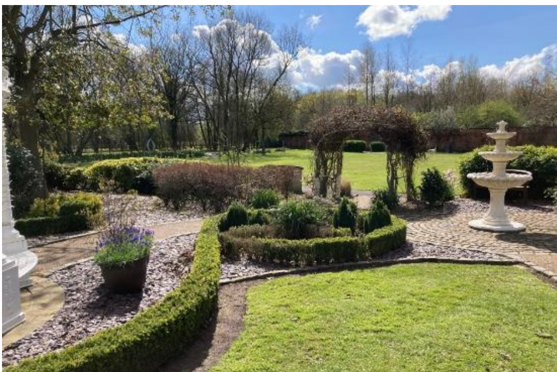
Plate 9: St Catherine's formal walled garden, facing south-west