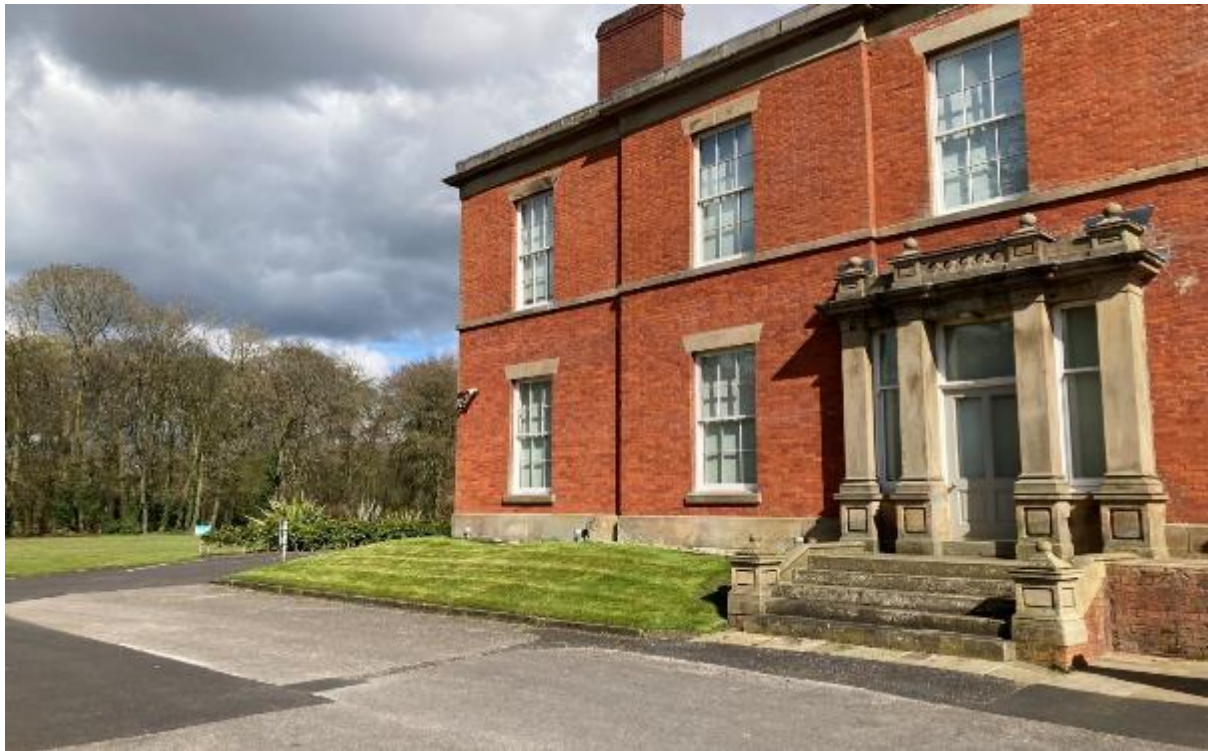
Plate 14: Farington House, facing north-east towards Stanifield Lane