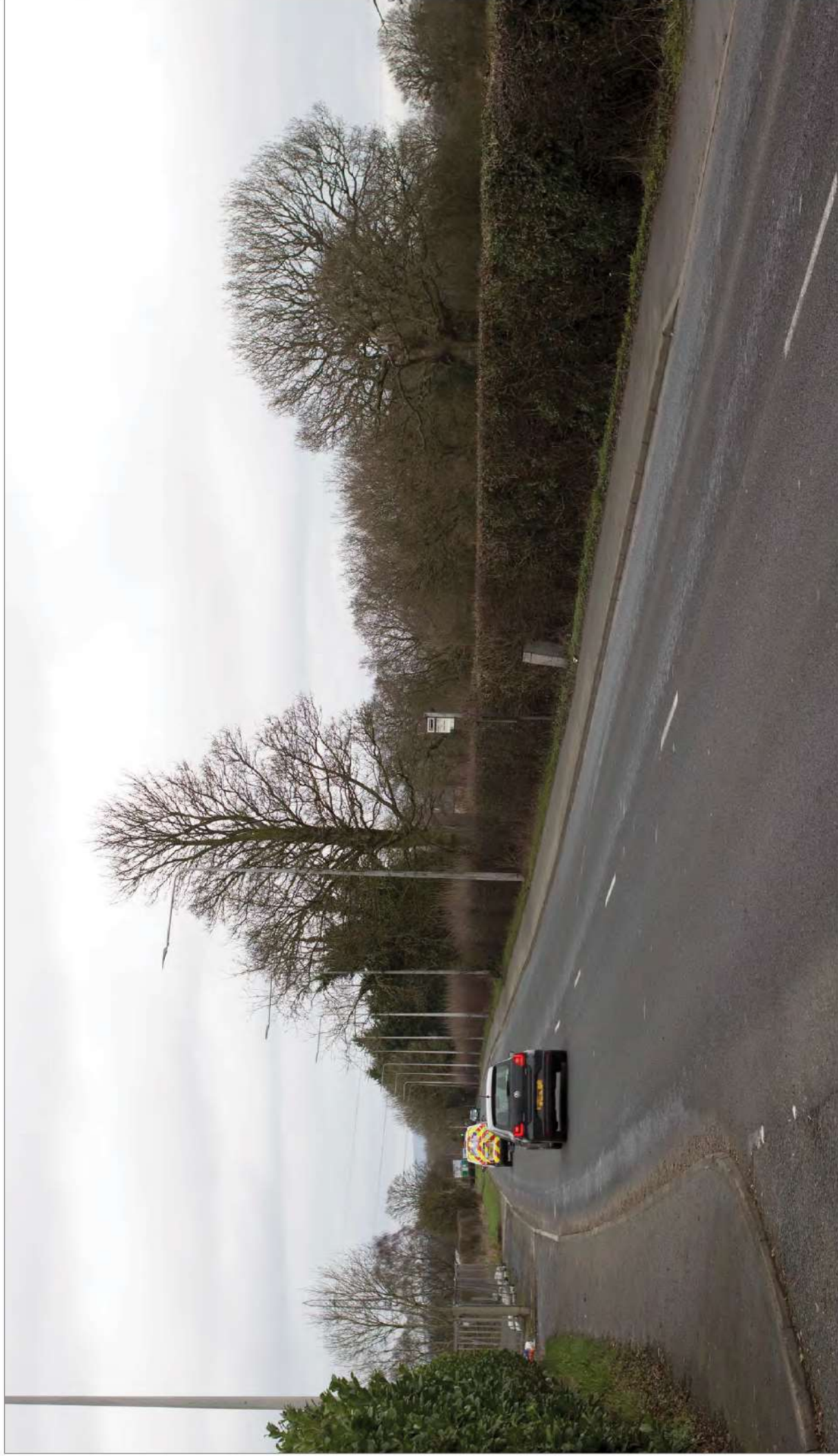
Viewpoint 8 Supporting Context Panorama