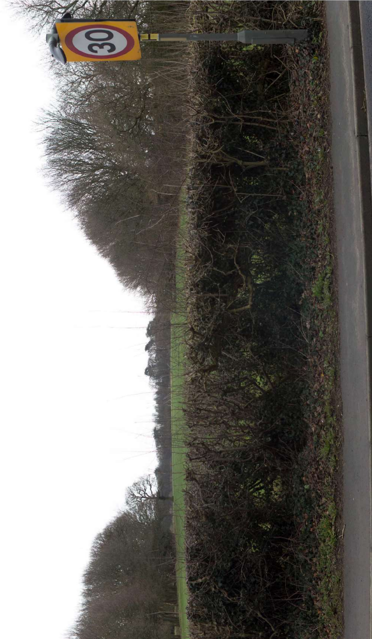
VIEWPOINT 8 NORTH EAST FROM FOWLER LANE AND STANFIELD LANE (A5083) JUNCTION