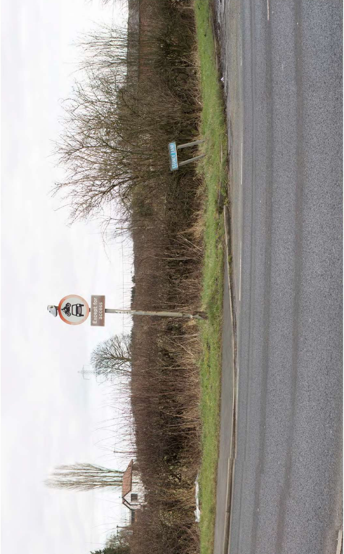
VIEWPOINT 13 EAST FROM PUBLIC FOOTPATH REFERENCE 9-12-FP2, WEST OF STANIFIELD LANE