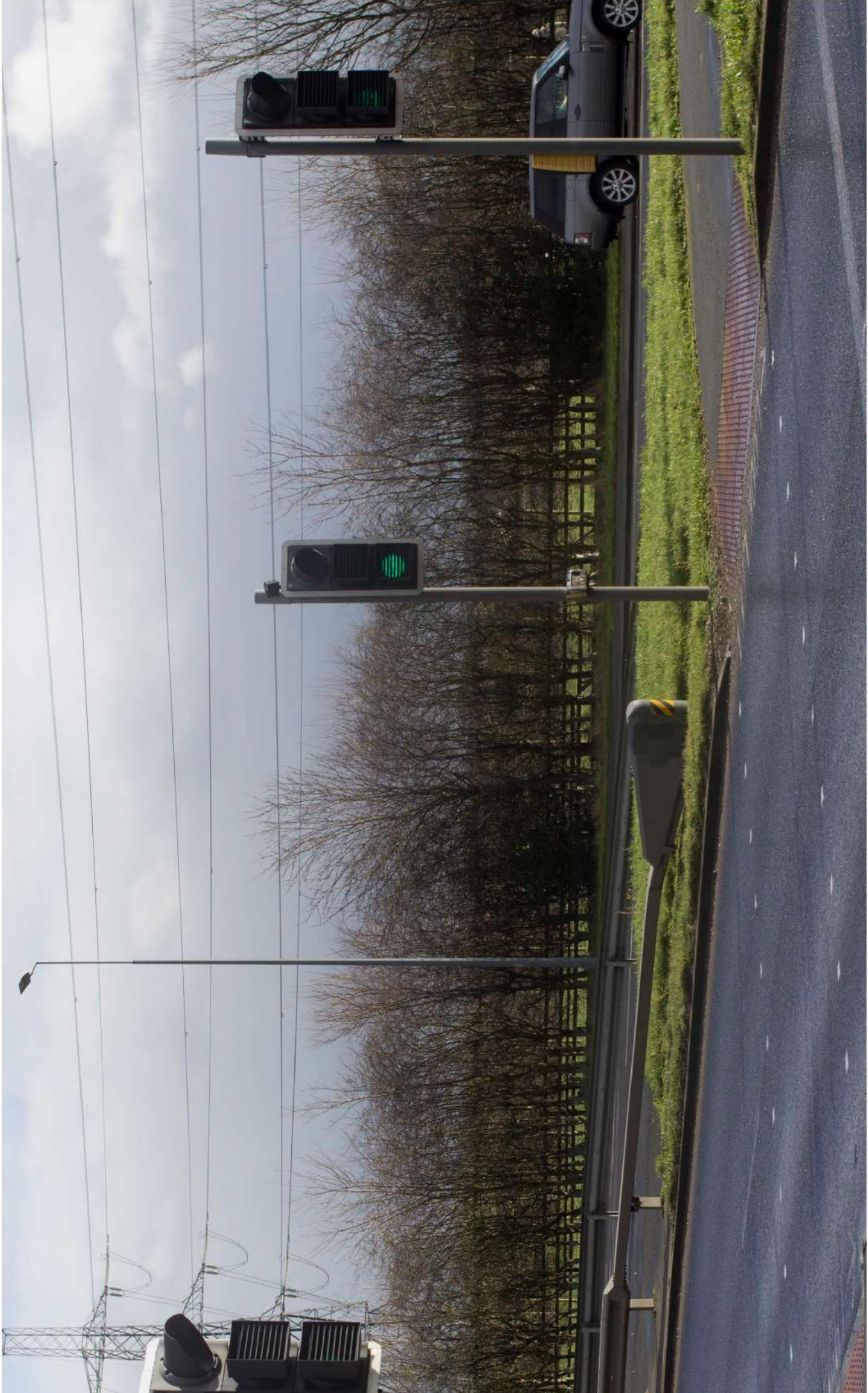
VIEWPOINT 11 SOUTH EAST FROM ROUNDABOUT AT INTERSECTION OF LOSTOCK LANE (A582), AND WATKIN LANE