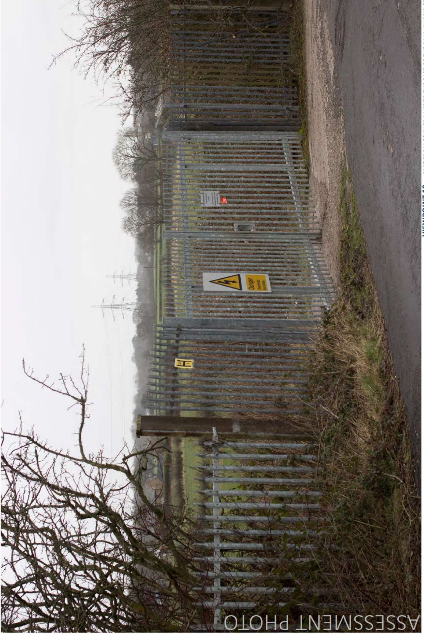
VIEWPOINT 10 EAST FROM FOWLER LANE TO THE EAST OF THE RAILWAY BRIDGE