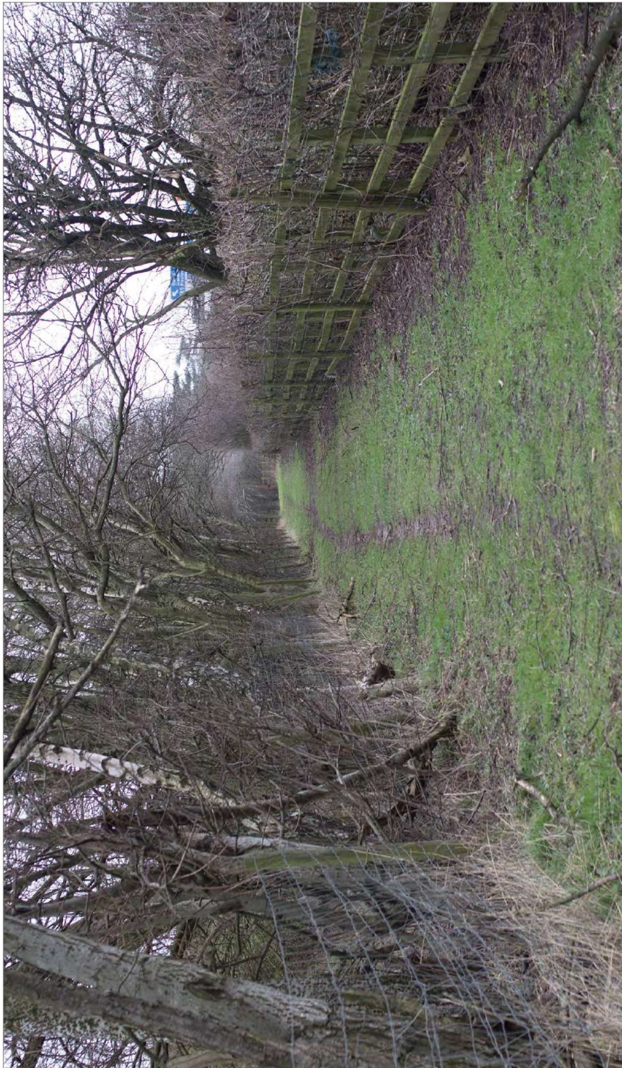
Viewpoint 6 Supporting Context Panorama