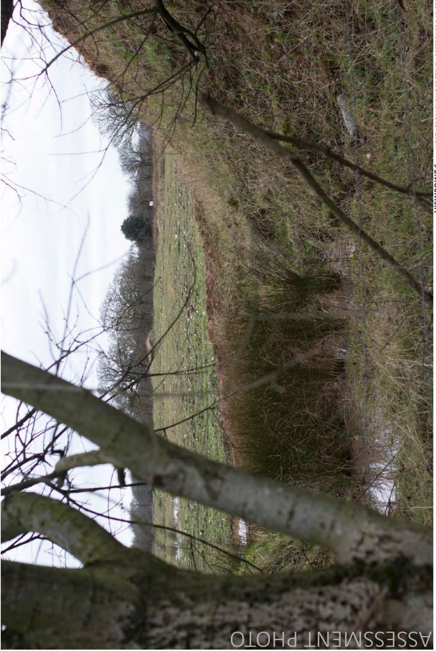
VIEWPOINT 6 NORTH FROM PUBLIC FOOTPATH REFERENCE 9-12-FP9