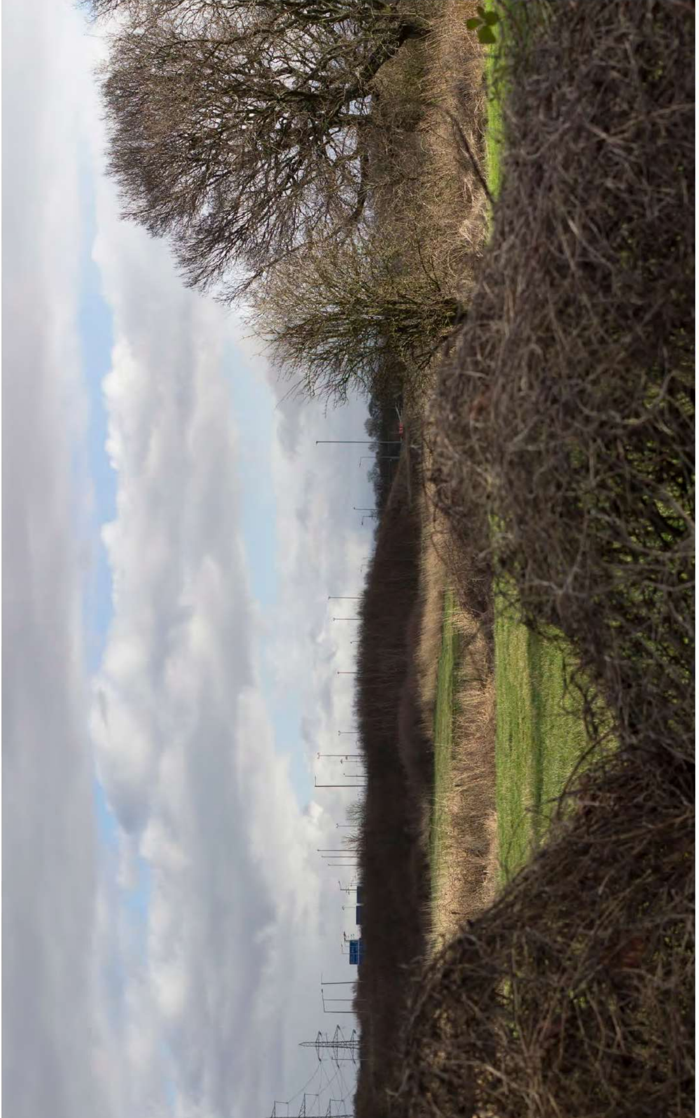
VIEWPOINT 15 EAST FROM RESIDENTIAL PROPERTIES ALONG OLD SCHOOL LANE