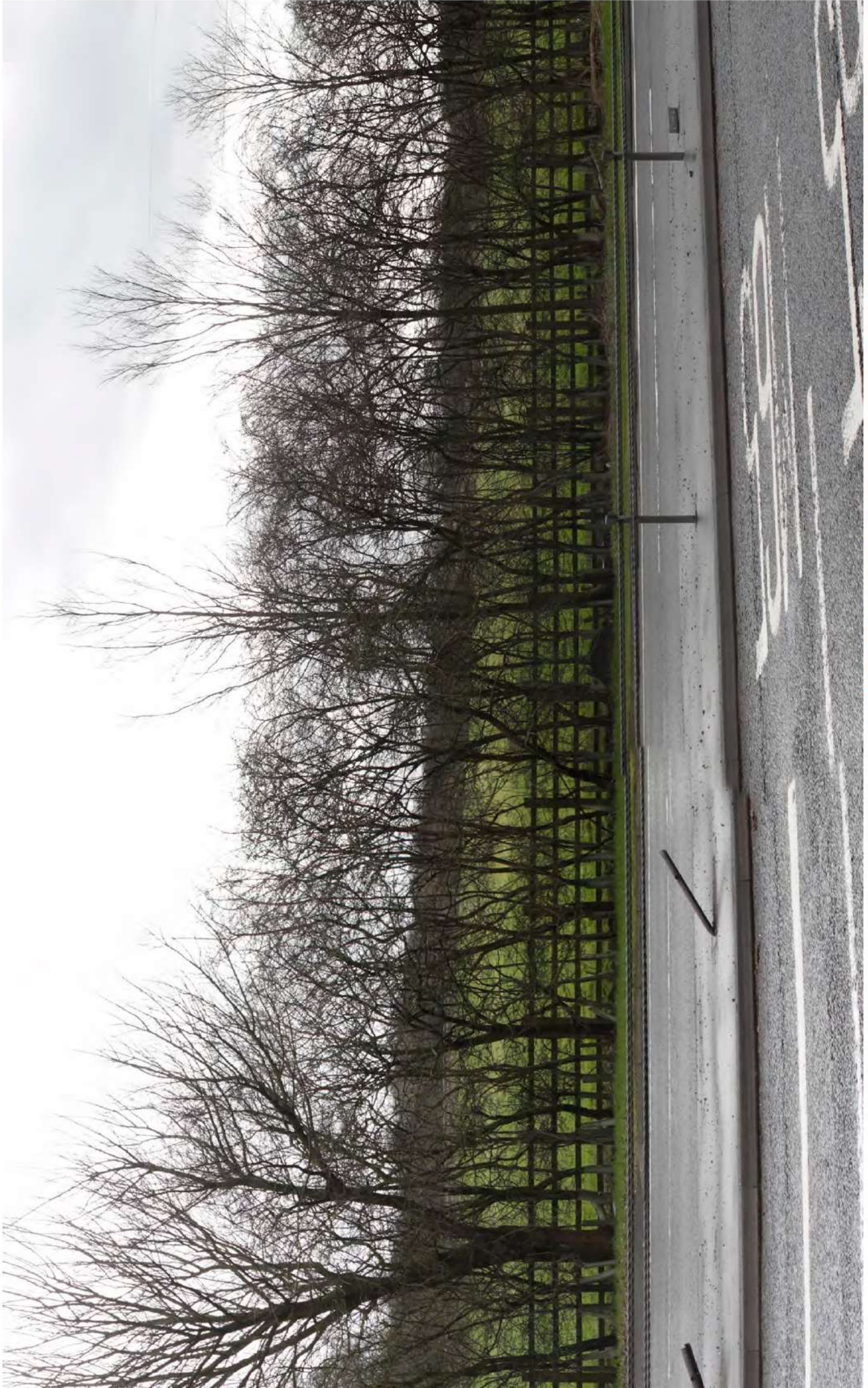
VIEWPOINT 12 SOUTH WEST FROM ROUNDABOUT AT INTERSECTION OF LOSTOCK LANE (A5820 AND LONDON WAY (A6)