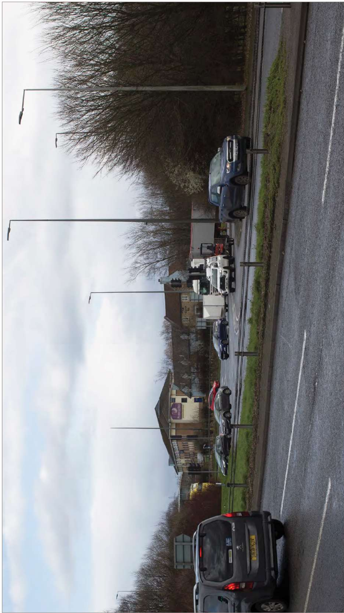
Viewpoint 12 Supporting Context Panorama