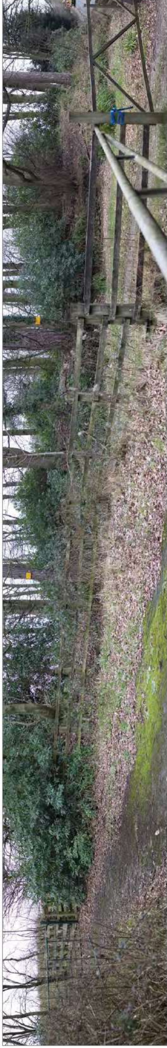
Viewpoint 4 Supporting Context Panorama