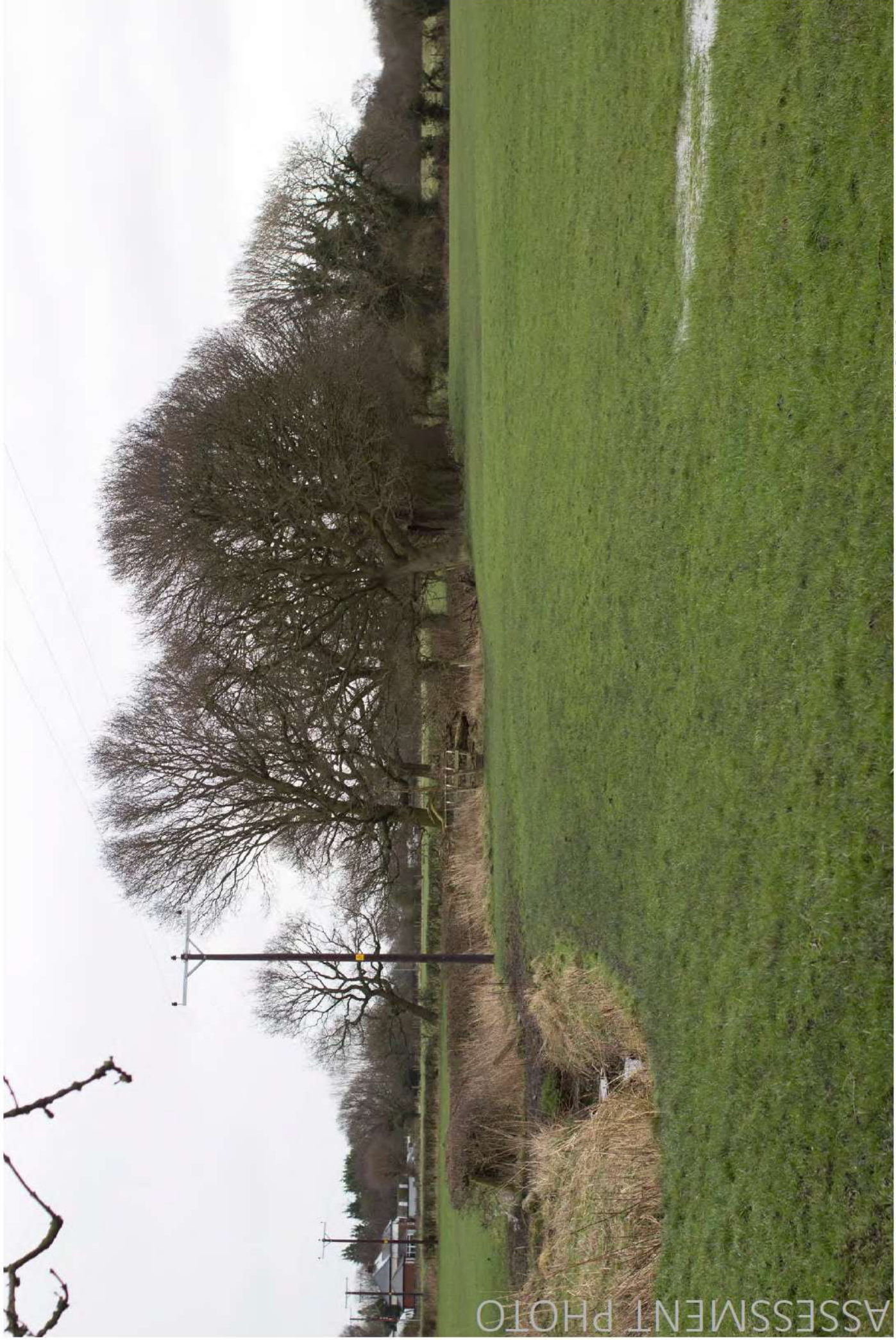
VIEWPOINT 9 EAST FROM PUBLIC FOOTPATH REFERENCE 7-4-FPS