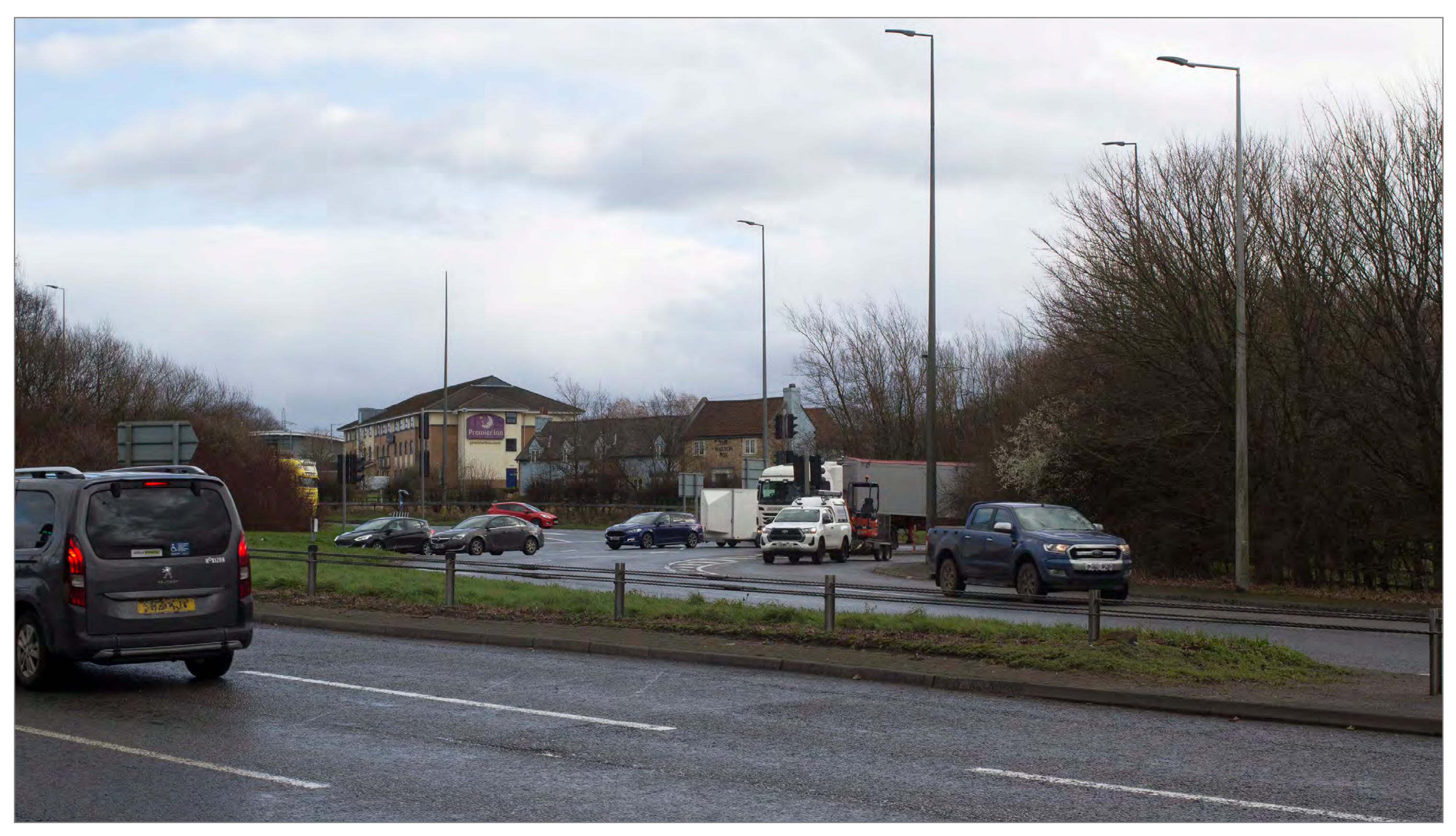
Viewpoint 12 Supporting Context Panorama