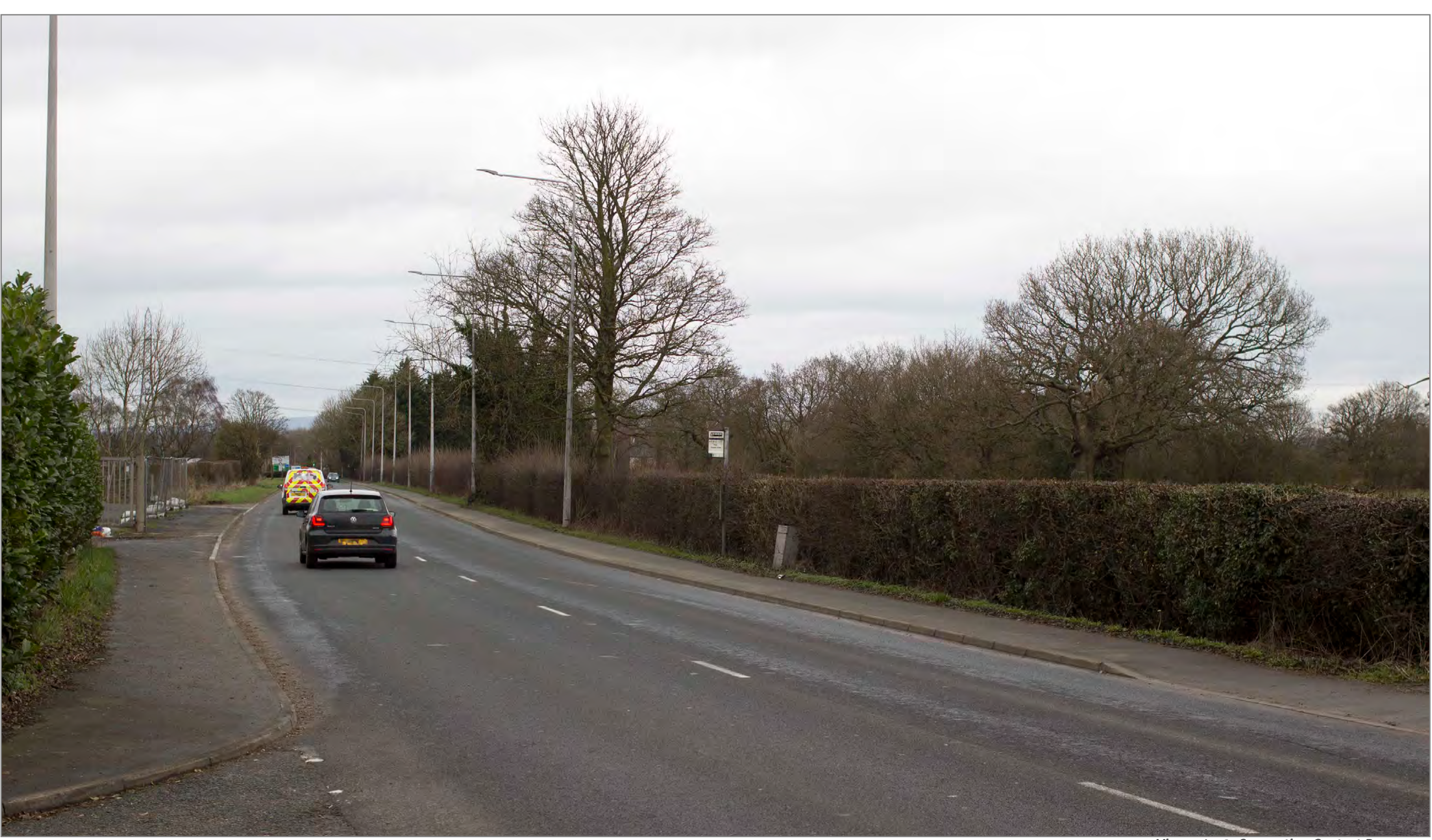
Viewpoint 8 Supporting Context Panorama