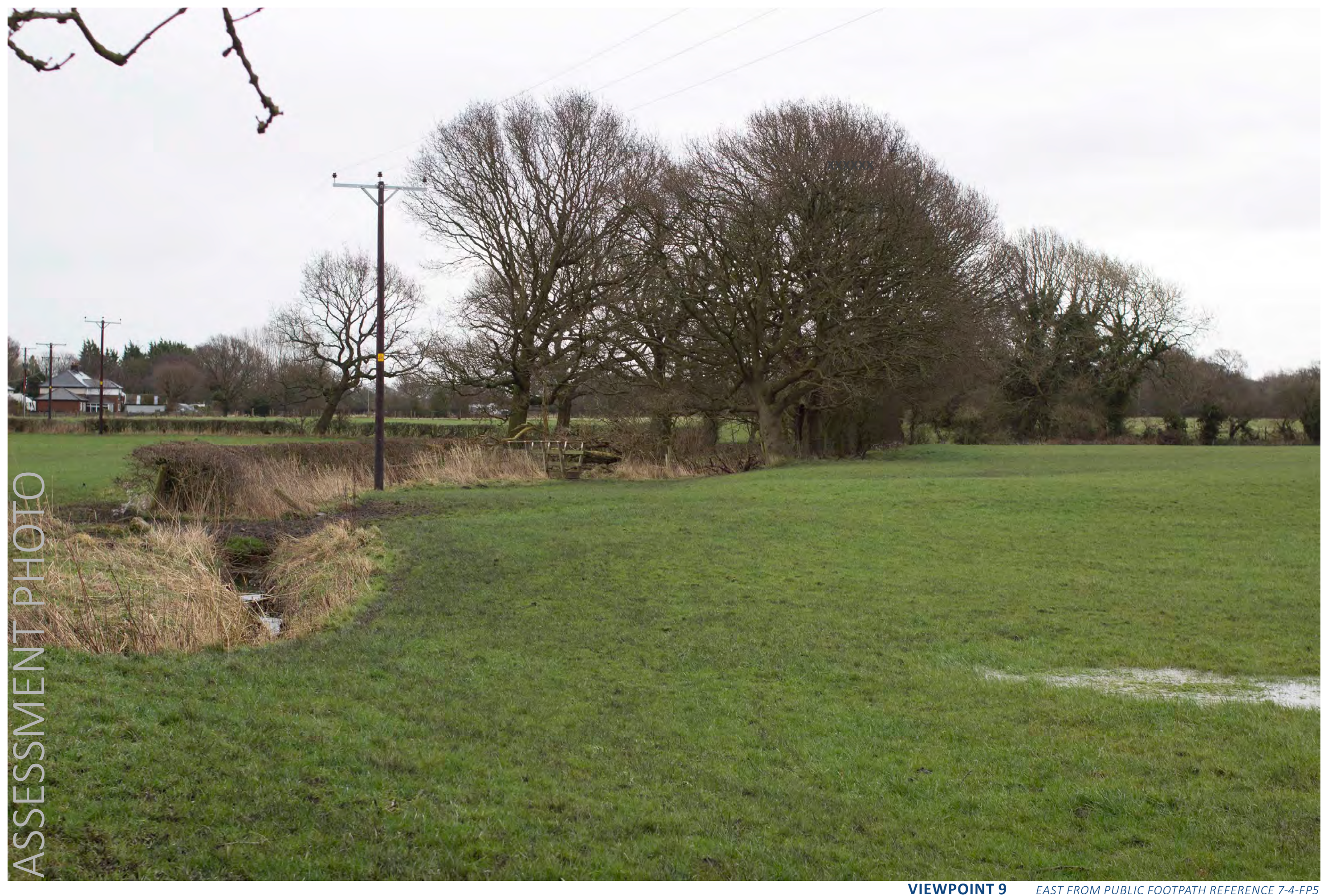
EAST FROM PUBLIC FOOTPATH REFERENCE 7-4-FP5