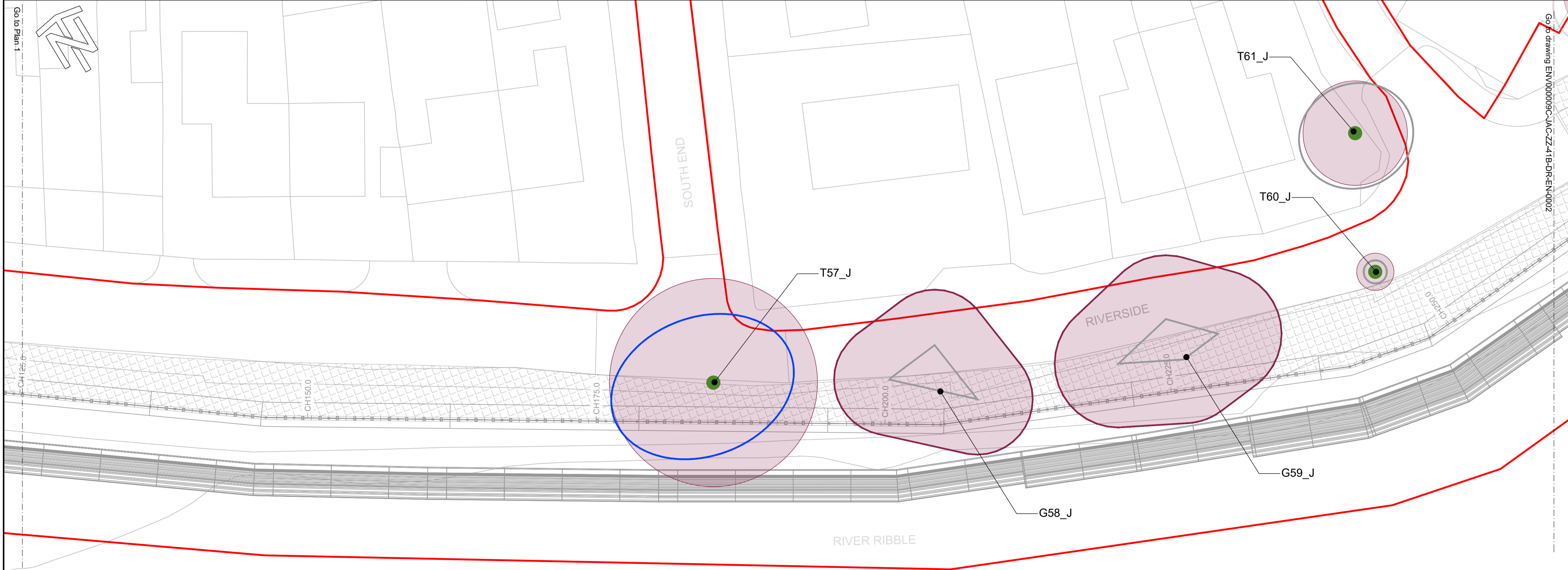
2 Plan 2 SCALE 1:200