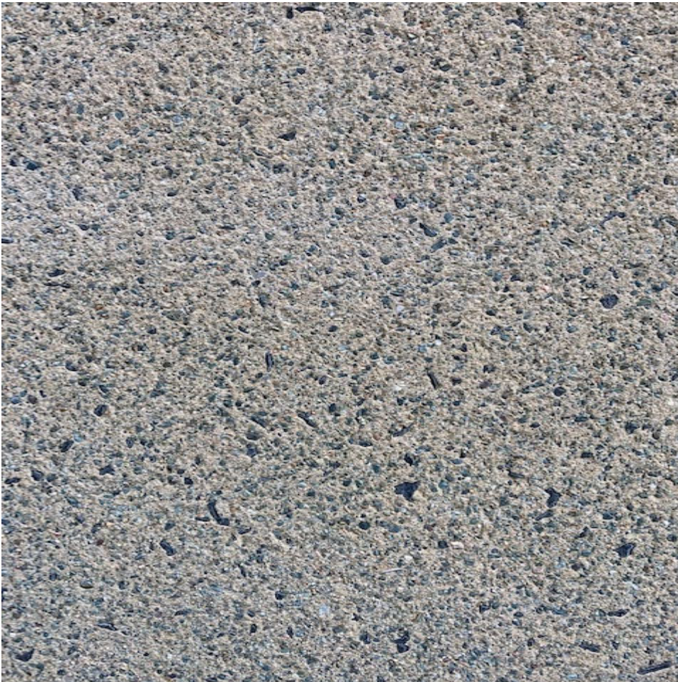
Picture-frame detail along top and sides of wall panel – acid etch finish 10mm exposed aggregate on recessed, centre panel