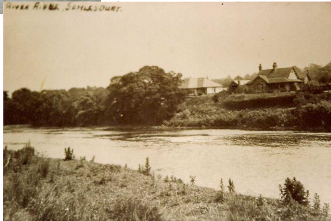
The Ribble's normal level.