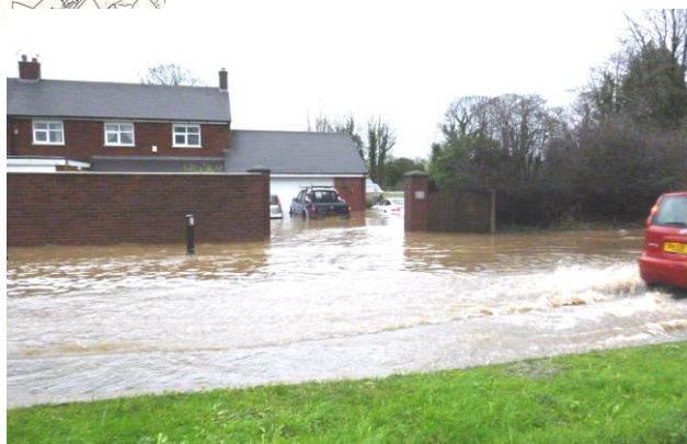
Property close to Junction 31 of the M6 at Samlesbury, on Boxing Day 2015.

Areas of Samlesbury, Brockholes and Elston that are known to flood.