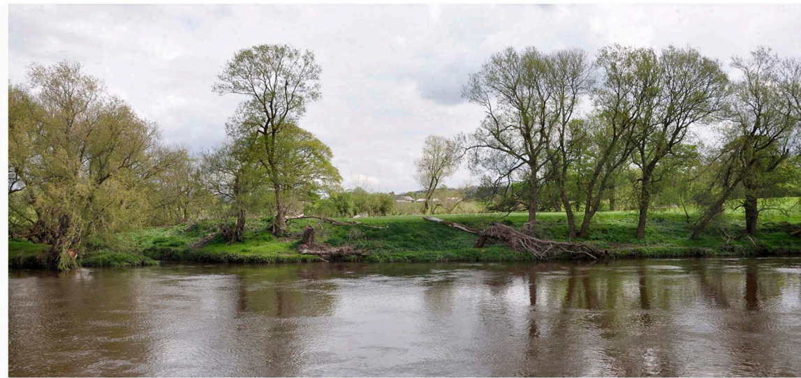
VIEWPOINT 41 - exit of Bezza Brook into River Ribble, Plant Site is located behind riverside vegetation.