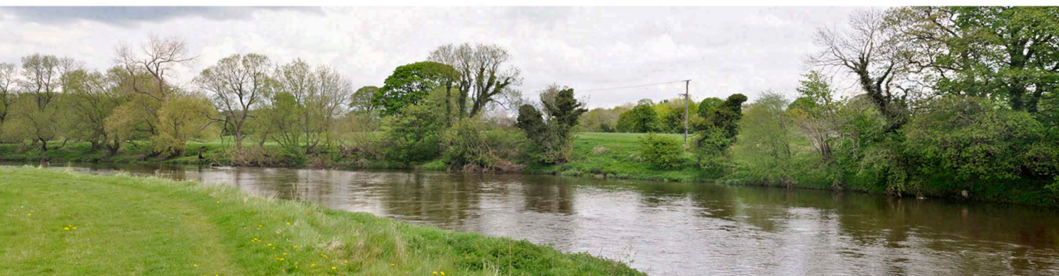
VIEWPOINT 45 - looking north from adjacent Seed House