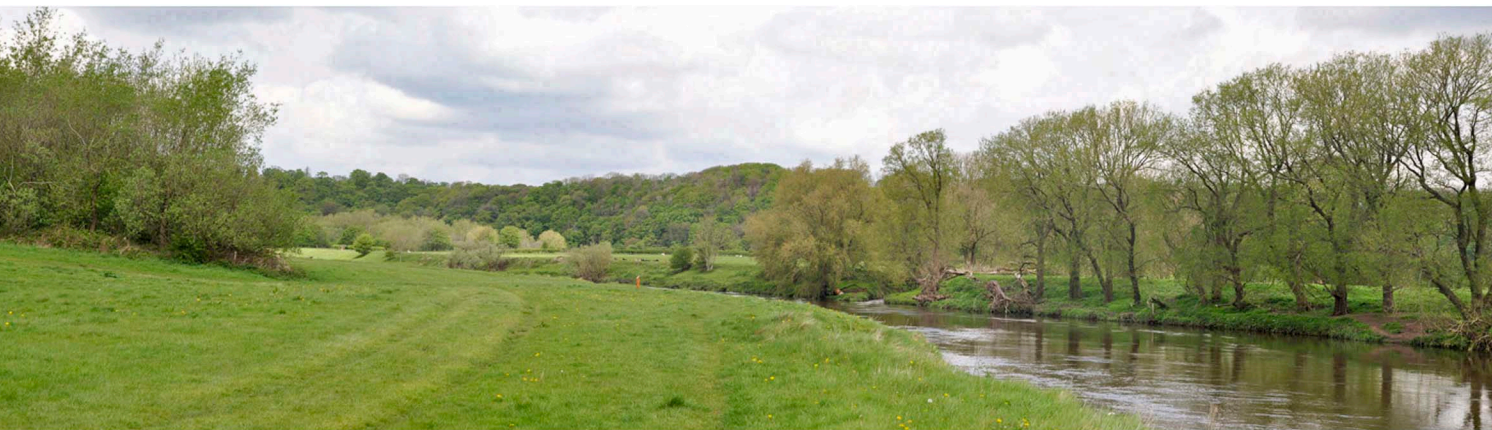
VIEWPOINT 44 - looking north from Viewpoint 43