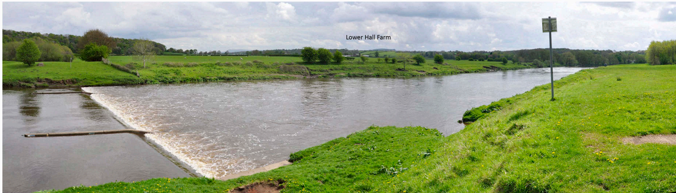
Lower Hall Farm

VISUAL IMPACT ASSESSMENT These views are taken at the edge of the River Ribble on the opposite bank to the proposed extraction site. Initial vegetation clearance and site strip work and views of the Plant Site, will have High potential visual impact, but as extraction deepens the retention of the 25 metre wide riverside margin will screen views into the base, reducing the impact to Medium .