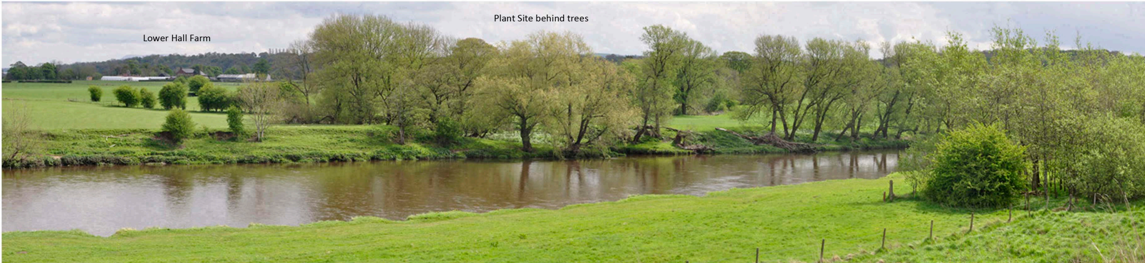
Lower Hall Farm