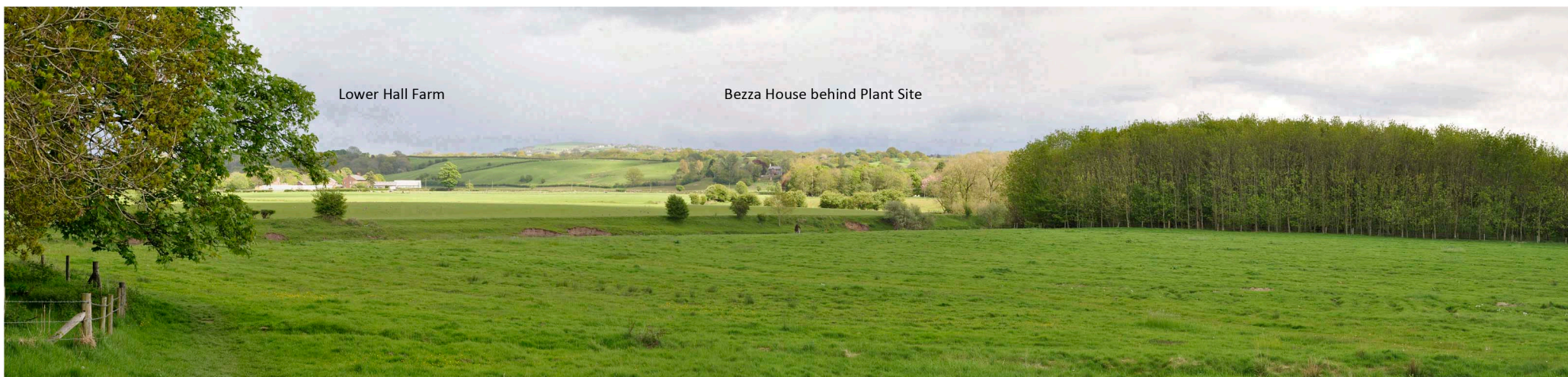
Lower Hall Farm