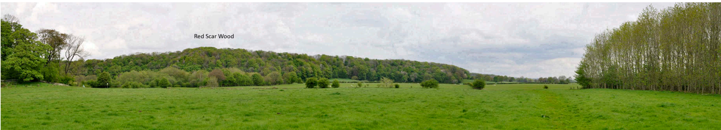
Red Scar Wood