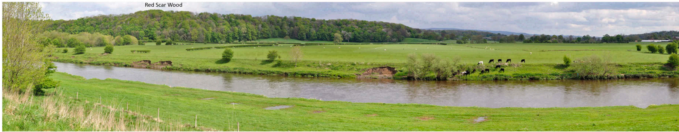
Red Scar Wood