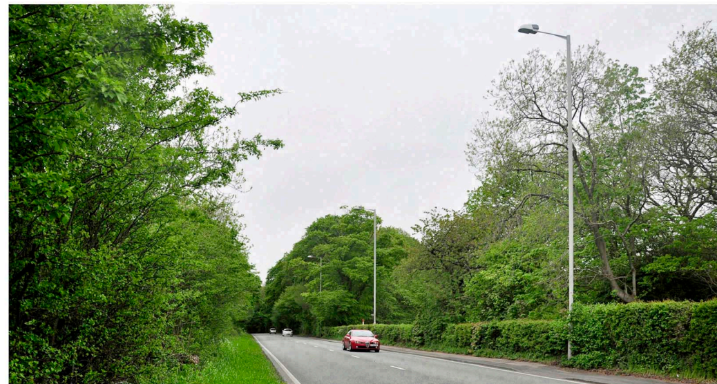
VIEWPOINT 3 - looking west along A59 from 'median'