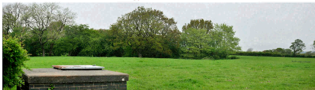
VIEWPOINT 6 - view of tree screen ????????