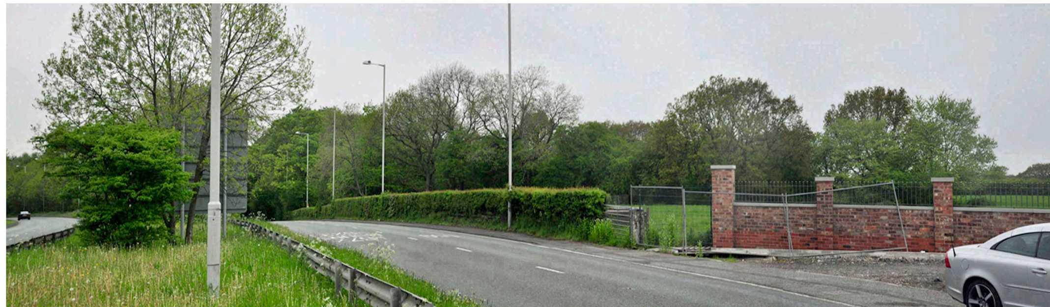
VIEWPOINT 5 - View from median opposite????