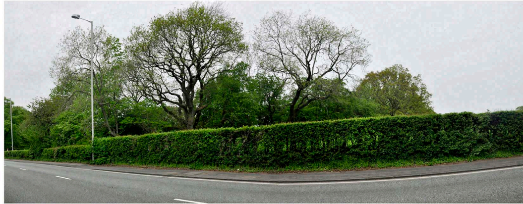
VIEWPOINT 2 - view from 'median' opposite east of Viewpoint 1