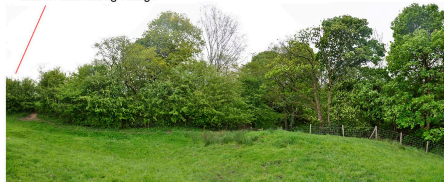
VIEWPOINT AI - looking east at south east corner of field