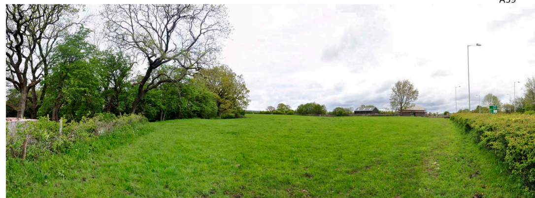
VIEWPOINT AJ - looking north from field east of proposed entrance