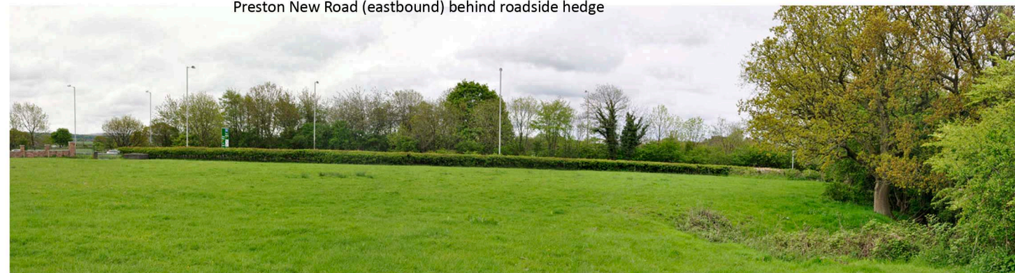
VIEWPOINT AL - three photographs giving a panoramic view across the field in which the proposed access road connects with the A59