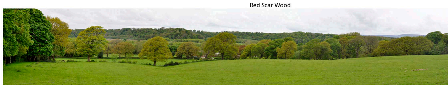
Red Scar Wood