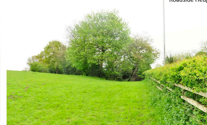
VIEWPOINT AK - looking east adjacent A59