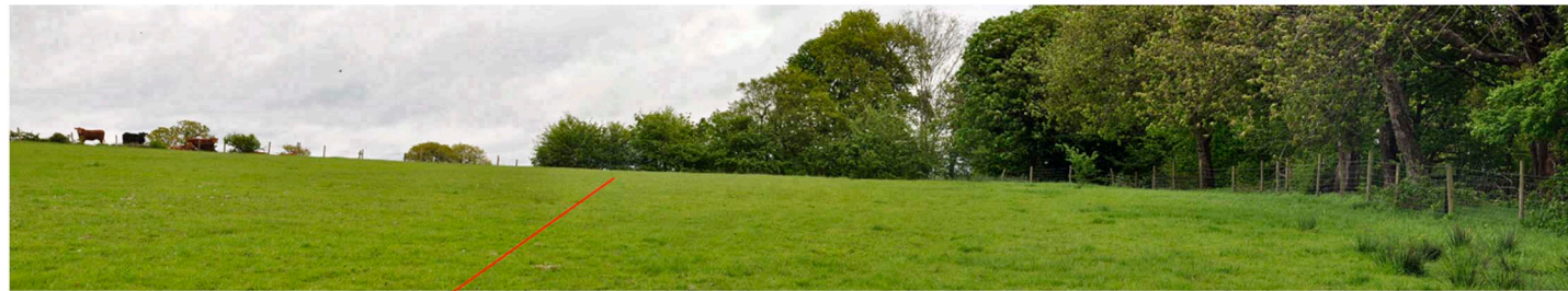
VIEWPOINT AG - looking east