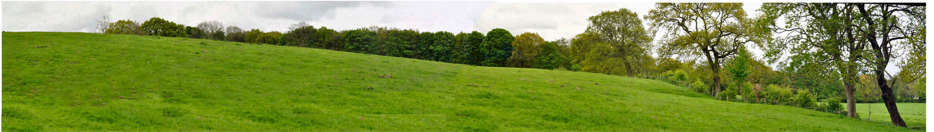
VIEWPOINT X - looking south from north west corner of field, route follows inside right hand boundary and inside edge of woodland Public right of way