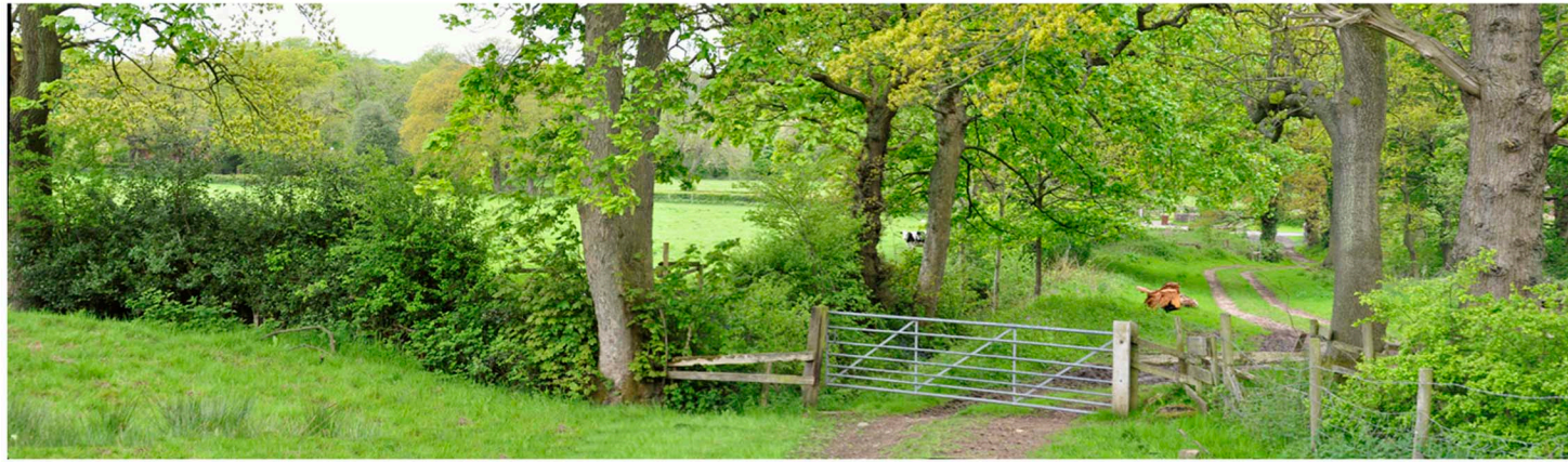
VIEWPOINT Y - looking west towards Potters Lane from proposed Access Road