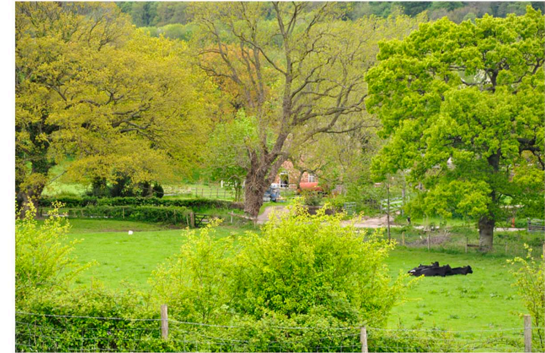
VIEWPOINT AB - zoom view to Riverside Cottage on Potters Lane