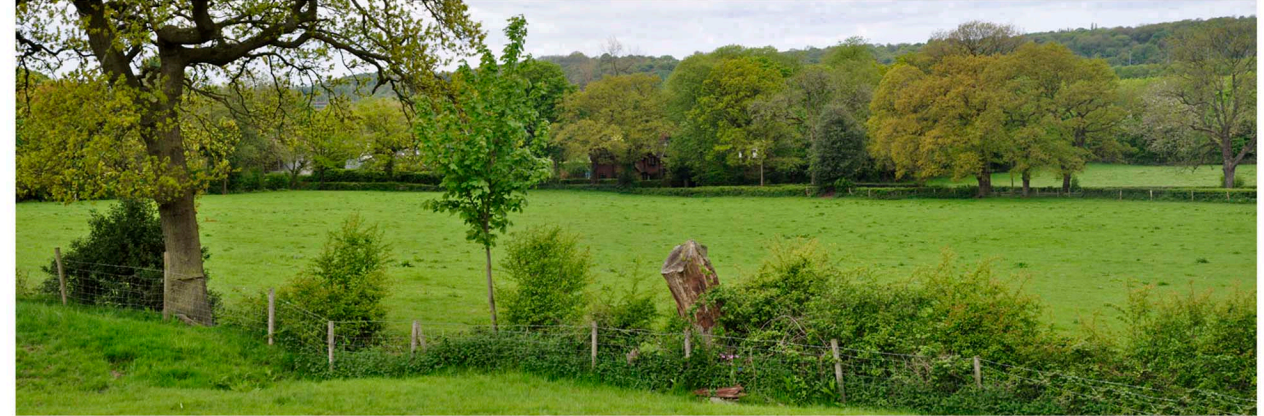
VIEWPOINT Z - looking west to Potters Lane