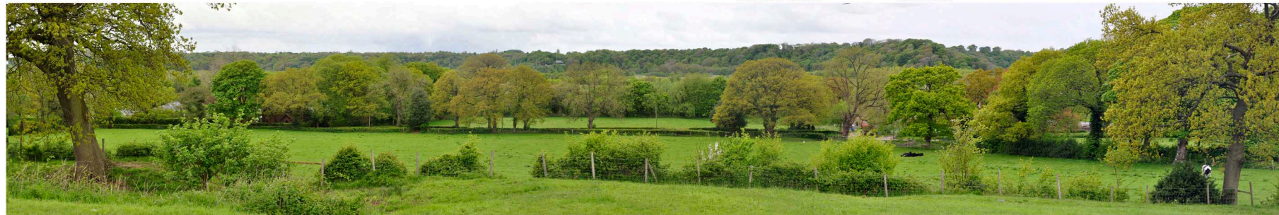
VIEWPOINT AA - looking west to Potters Lane