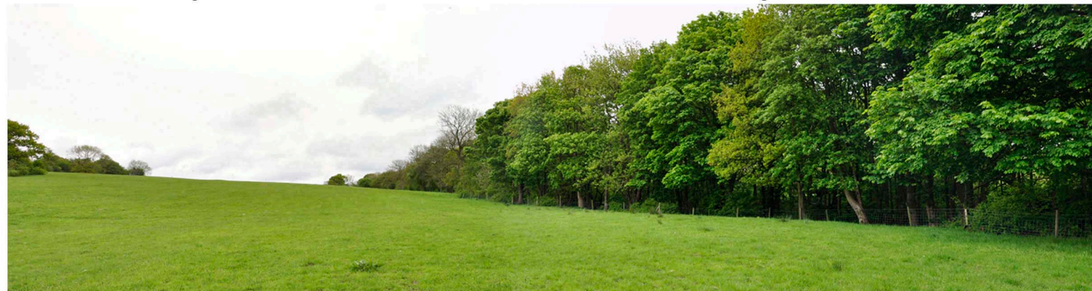
VIEWPOINT AD - looking east along edge of copse

VISUAL IMPACT ASSESSMENT Views are possible from these viewpoints to the access road as it crosses the public right of way with only the loss of a small section of hedgerow. The road then runs in the field to the south.