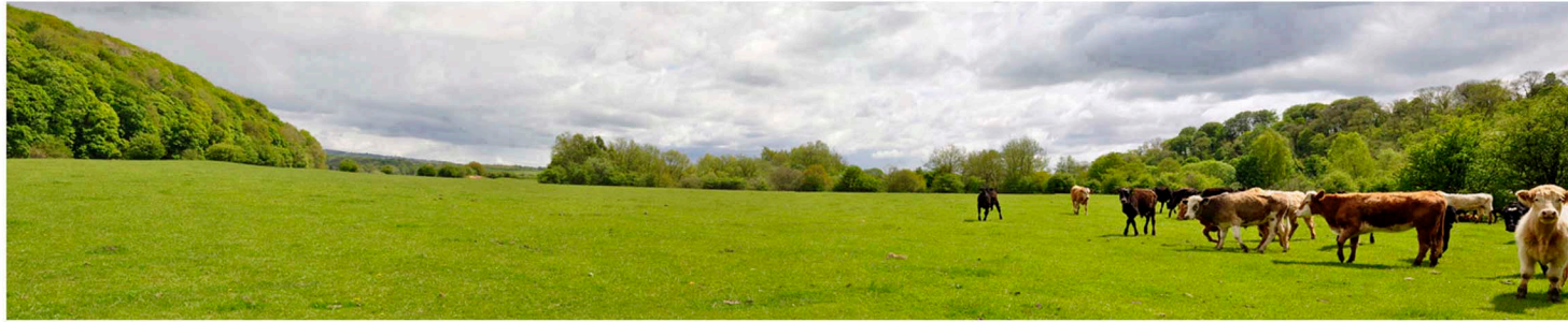
VIEWPOINT L - Looking south east from north western end of Site