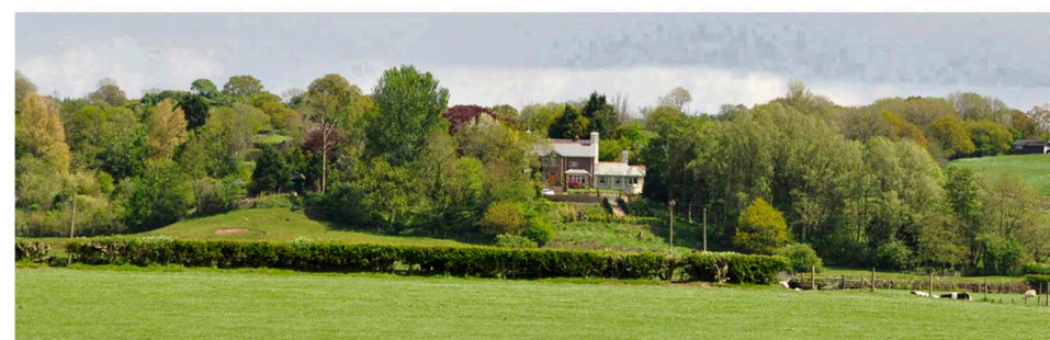
Enlarged view to Bezza House (see Viewpoint Q below)