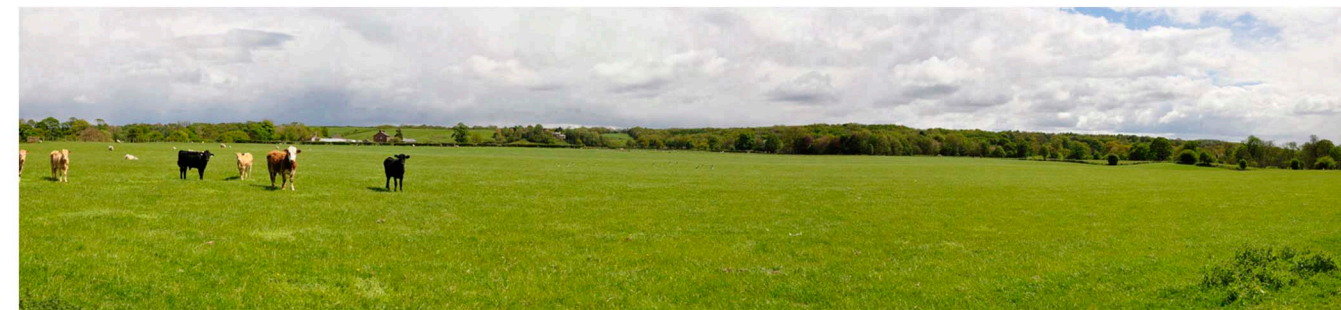
VIEWPOINT P - Looking south east from field boundary. Lower Hall Farm