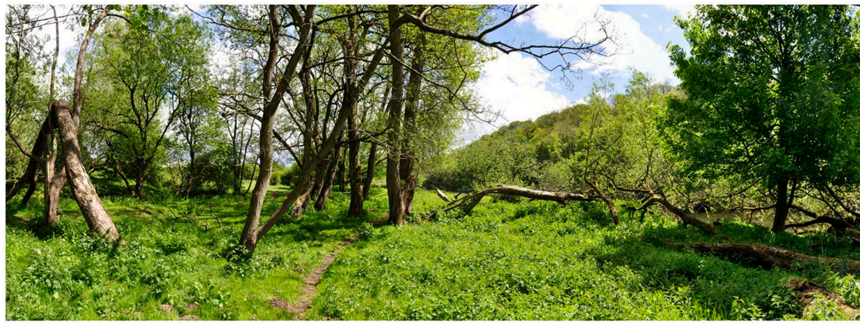
VIEWPOINT J - view of riverside vegetation