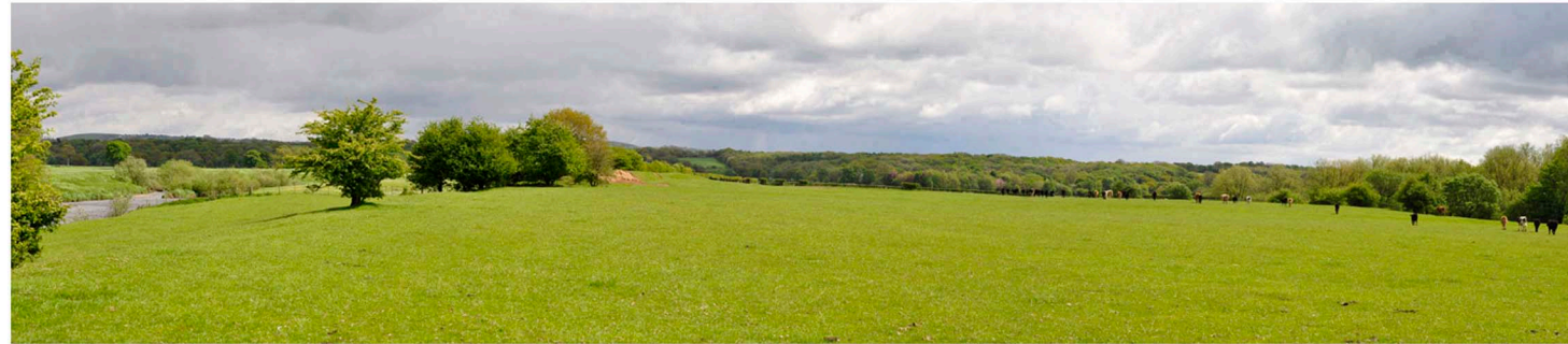
VIEWPOINT N - Looking south east along northern section of site.