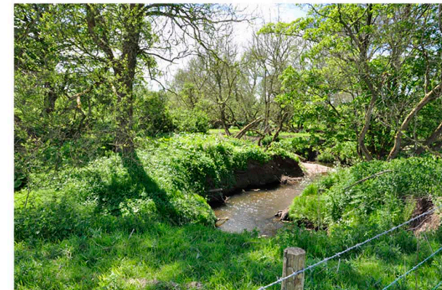
VIEWPOINT R - view of Bezza Brook

VISUAL IMPACT ASSESSMENT - Views of the northern section of the Application Site, in the area of former excavations and alongside the river. These photographs demonstrate the openness of the northern and eastern fields. However views into this section are confined to Lower Hall Farm and Bezza House as shown (see Drawing No.1040/PL33 for reverse views) The screen riverside vegetation along Bezza Brook is also illustrated.