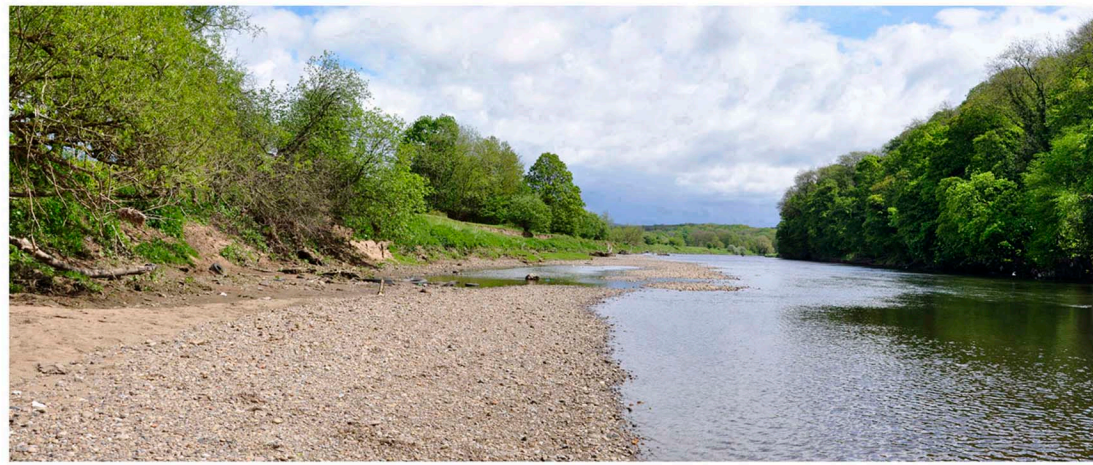
VIEWPOINT K - looking south east along river shoreline