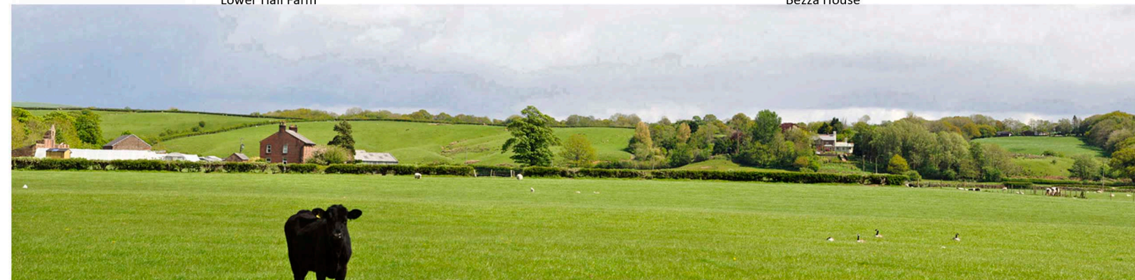
VIEWPOINT Q - looking east from extraction site