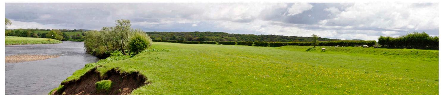
VIEWPOINT O - View along River Ribble looking south east.