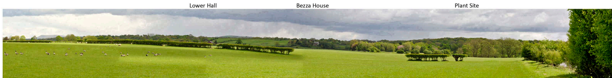
VIEWPOINT E - looking east and north east