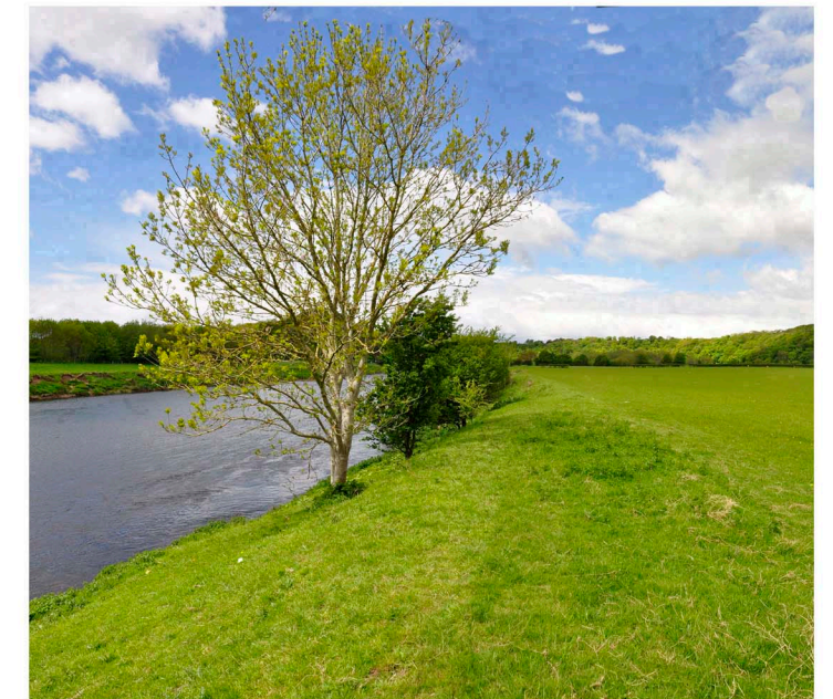
VIEWPOINT F - looking north west along river bank