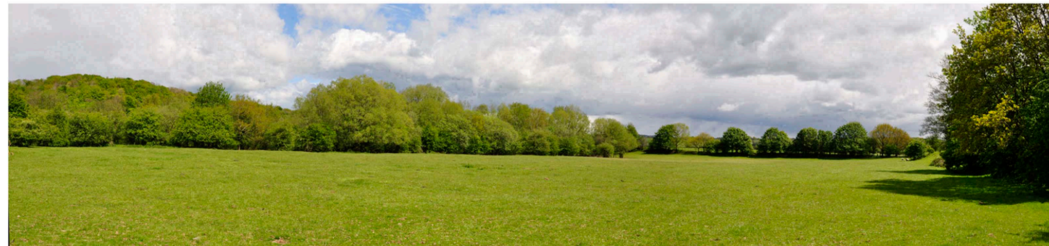
VIEWPOINT H - looking north