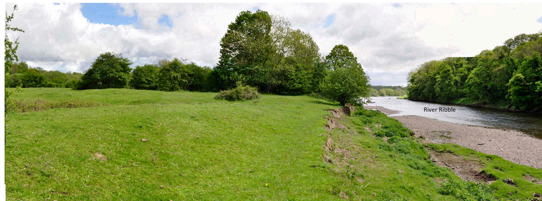
VIEWPOINT I - looking south east along river bank