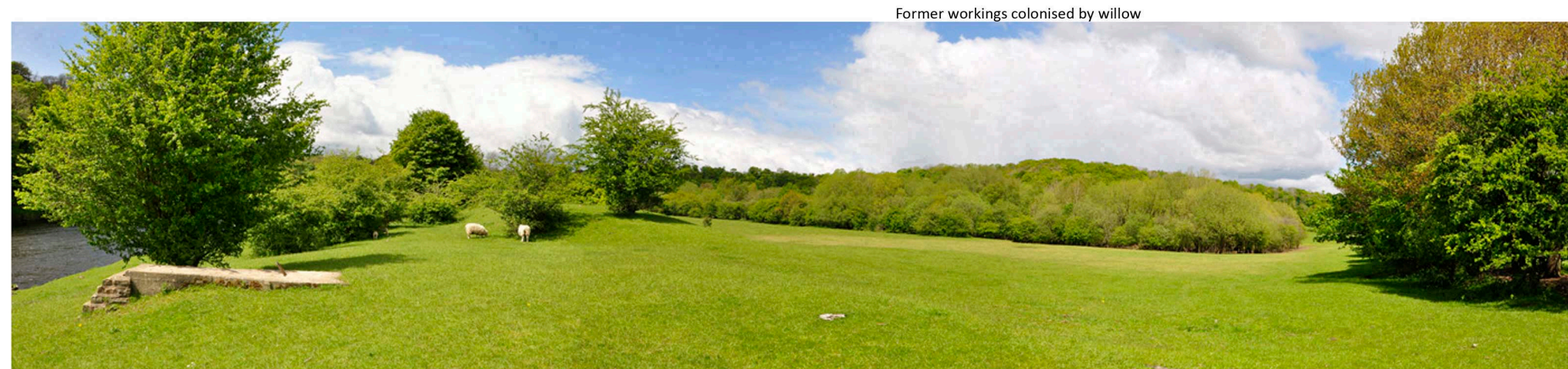
VIEWPOINT G - looking north west towards area of former working