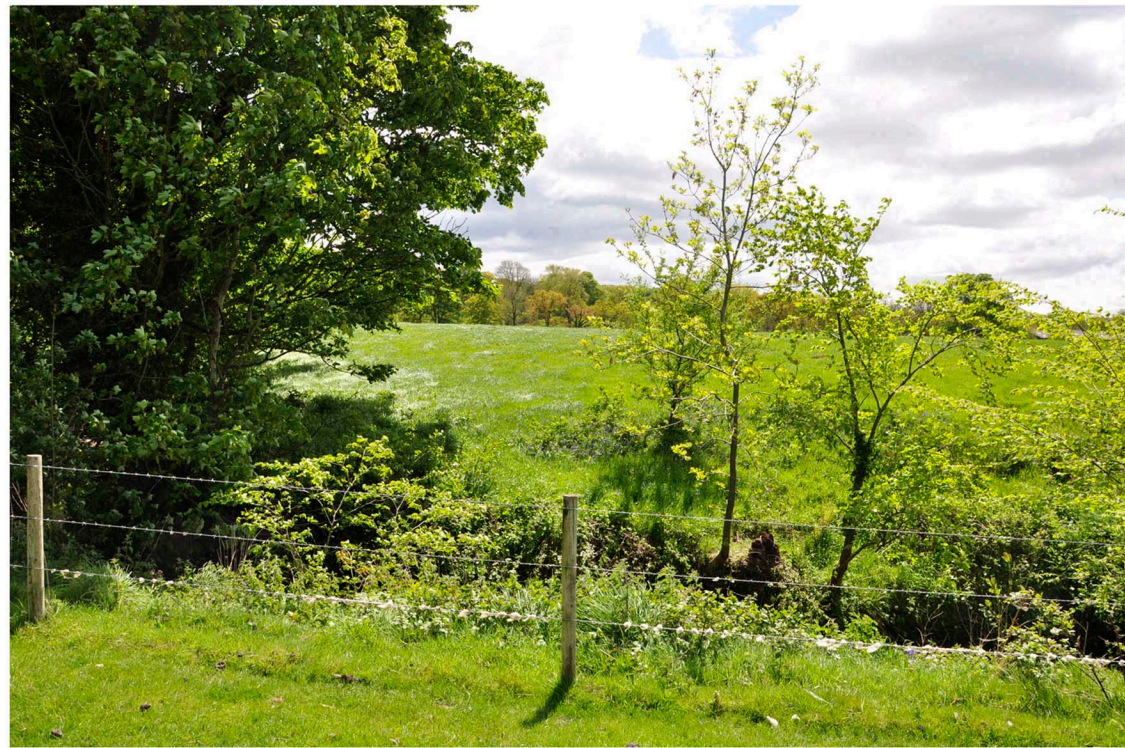
VIEWPOINT A - looking back to Potters Lane from proposed plant site (see Visibility Photograph 15 for reverse view)