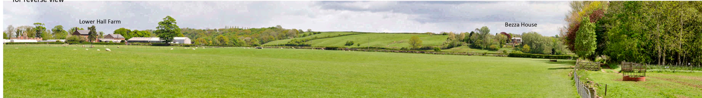
VIEWPOINT C - looking east from eastern edge of proposed extraction site, over the site of the proposed east screen bund