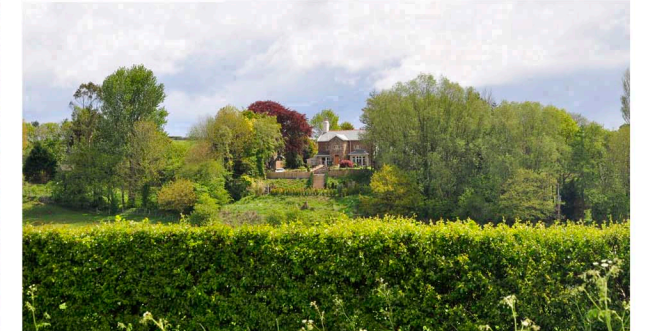
Zoom lens view looking east to Bezza House from Viewpoint C (See Viewpoint 46 on 1040/PL33 for reverse views)