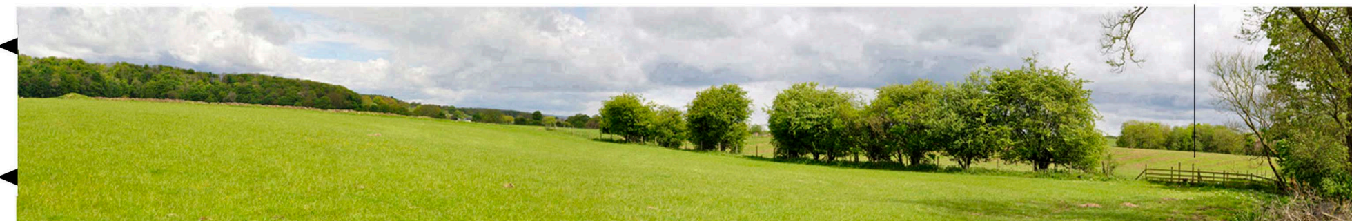
VIEWPOINT D - two photographs giving a panoramic view west across the proposed extraction site.