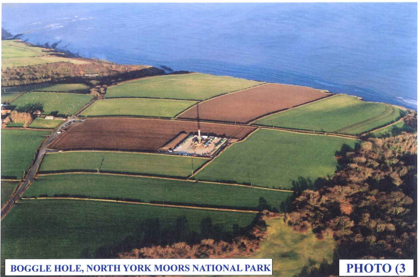
BOGGLE HOLE, NORTH YORK MOORS NATIONAL PARK