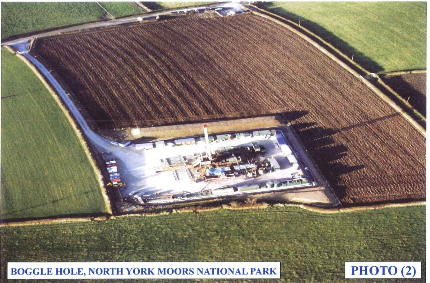
BOGGLE HOLE, NORTH YORK MOORS NATIONAL PARK