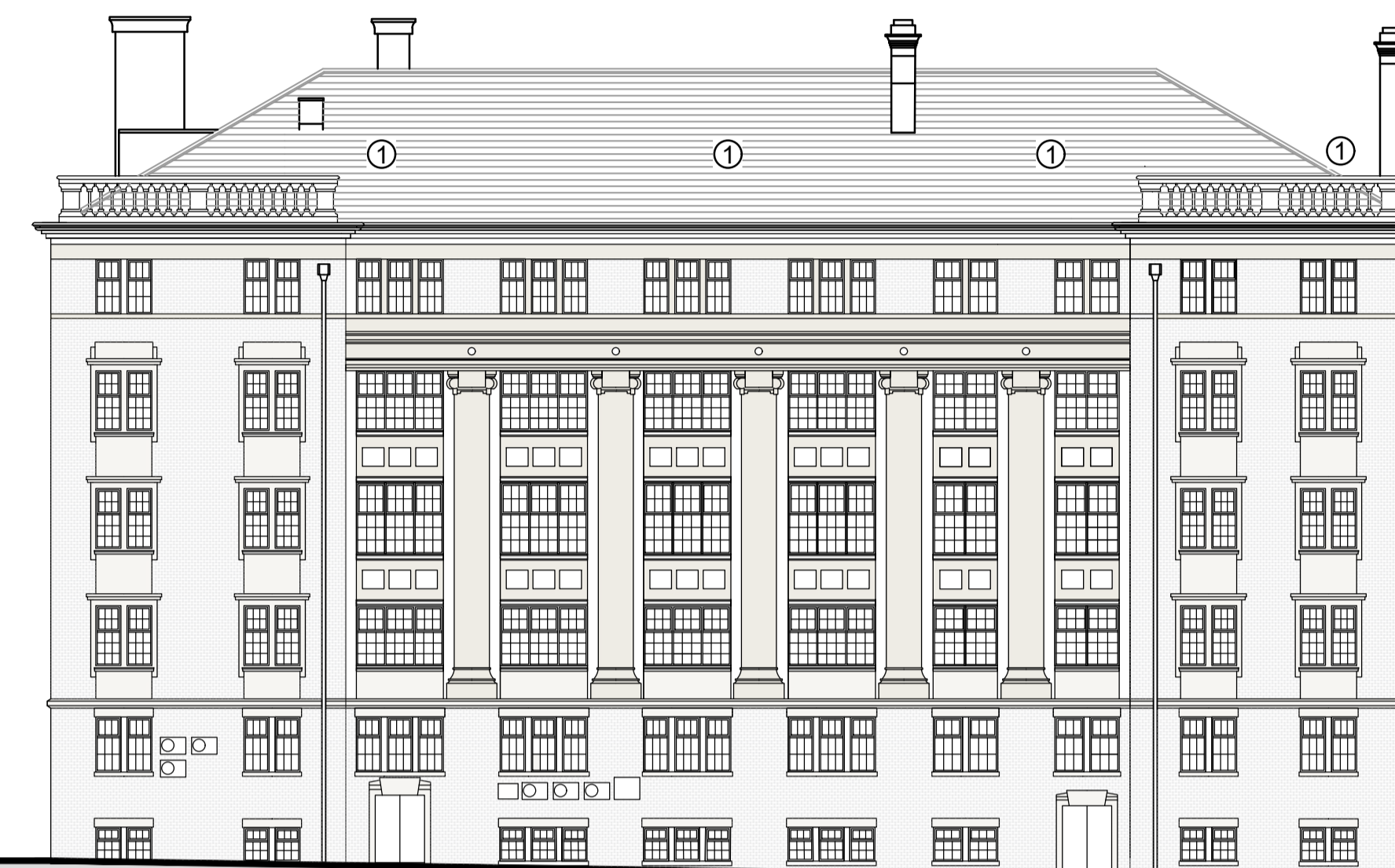
ARTHUR STREET ELEVATION (2) NORTH