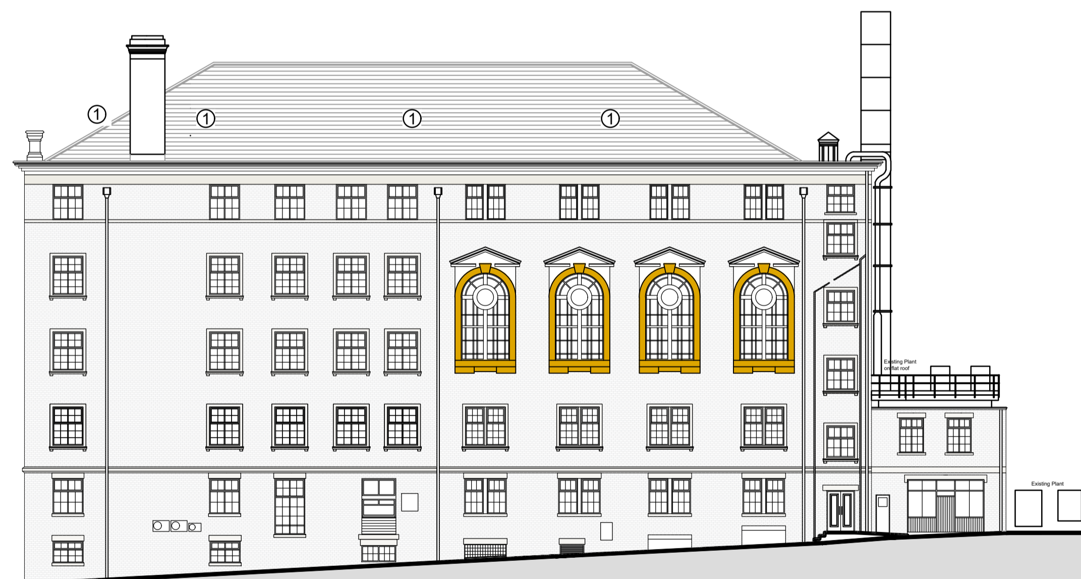
INNER COURTYARD ELEVATION (3) WEST