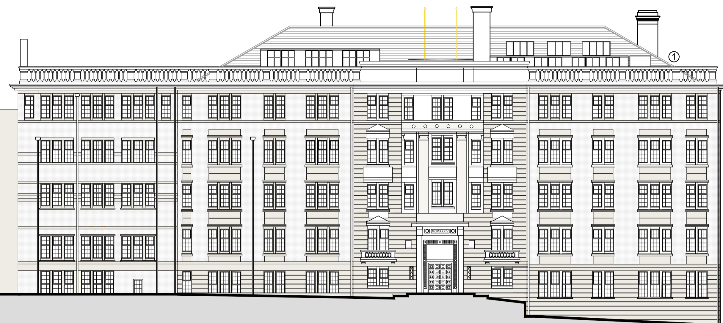
PITT STREET ELEVATION (1) EAST