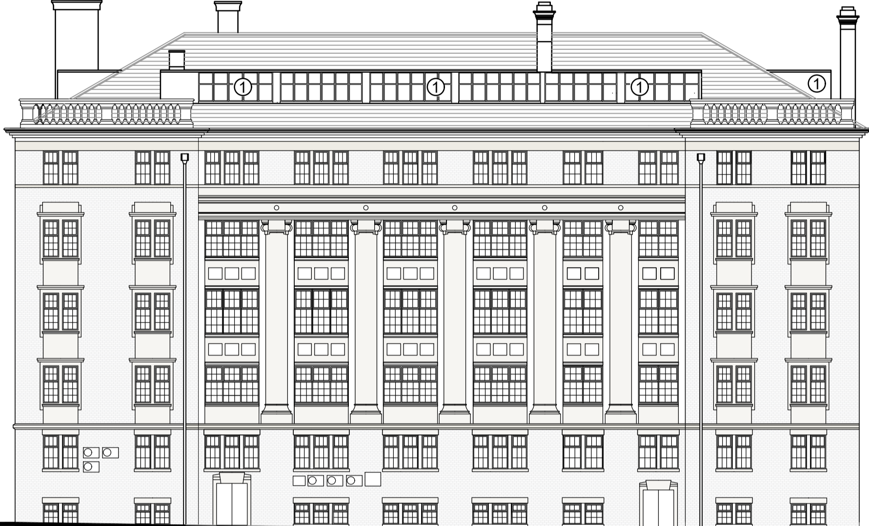
ARTHUR STREET ELEVATION (2) NORTH

KEY ① Flat felt roof dormers with uPVC windows