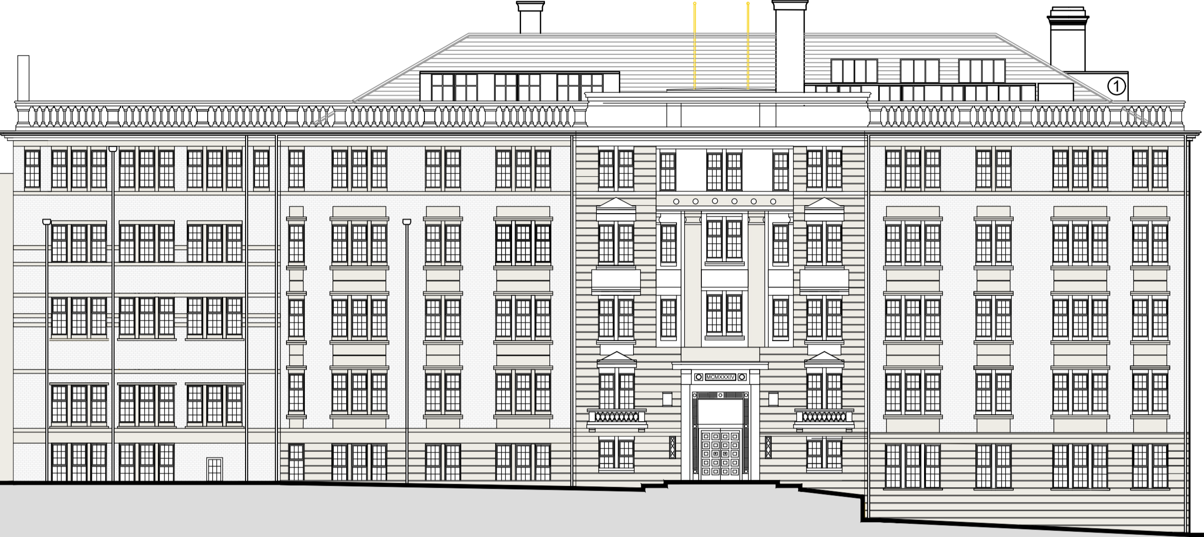
PITT STREET ELEVATION (1) EAST

SITE INVESTIGATION a survey of the site is to be carried out by a suitably qualified person including an initial ground investigation, a desk study and a walk over survey. a copy of all reports and surveys to be sent to building control for approval before works commence on site. any asbestos, contaminated soil or lead paint found on the site is to be removed by a specialist. asbestos is to be dealt with in accordance with the control of asbestos regulations 2006.