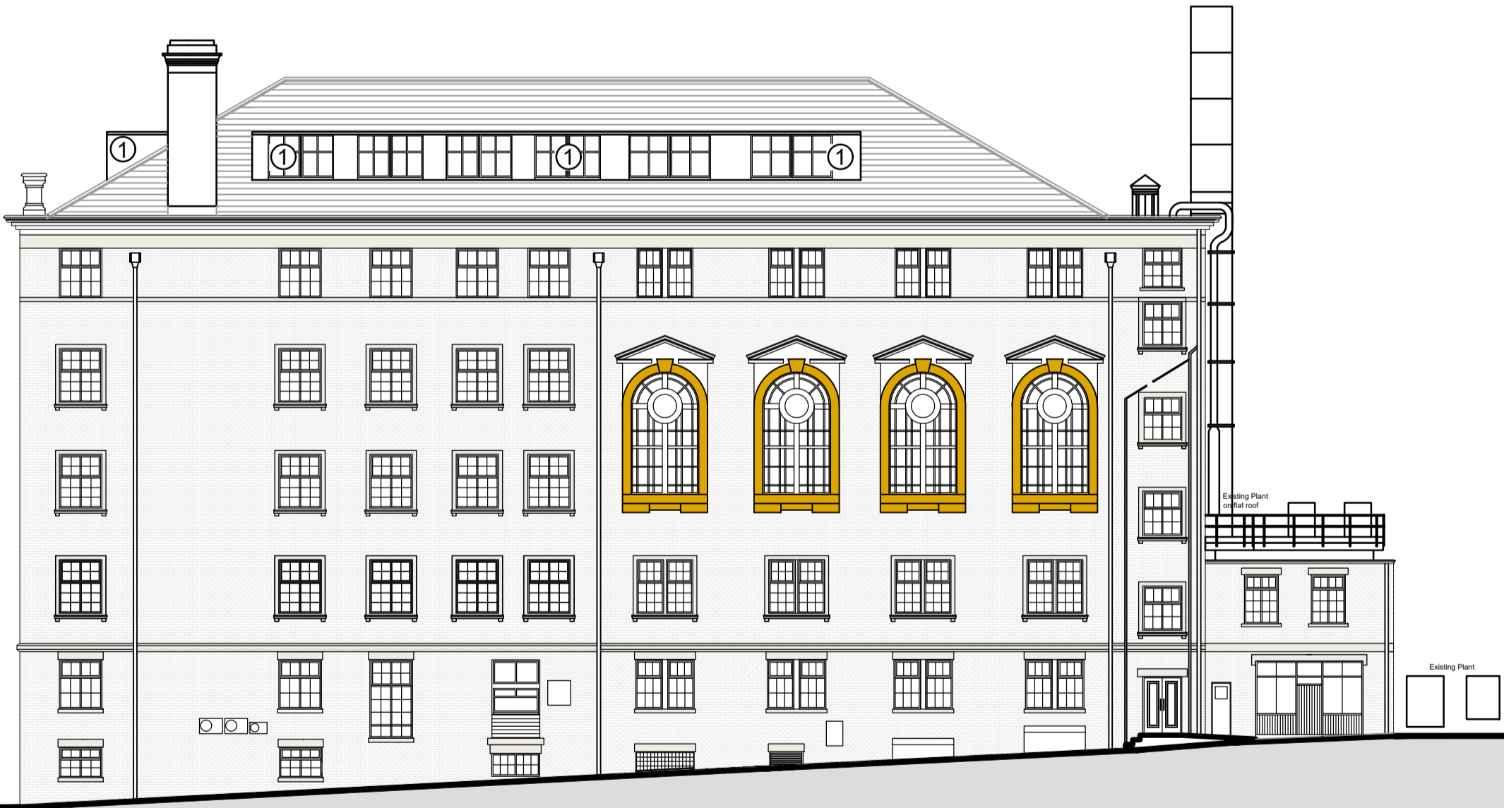
INNER COURTYARD ELEVATION (3) WEST

KEY ① Flat felt roof dormers with uPVC windows