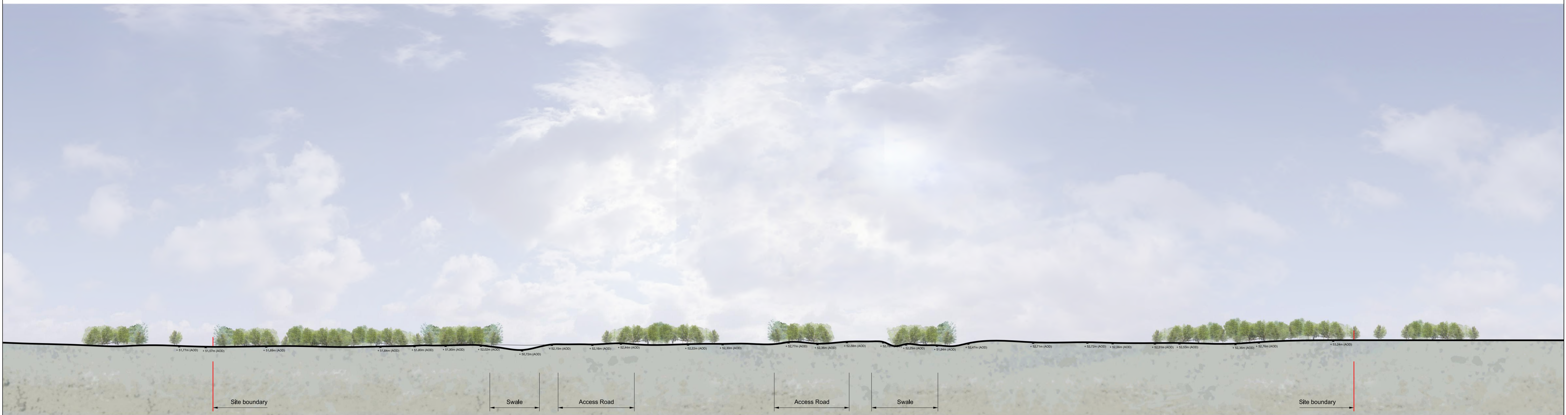
Section B-B, Through Site Looking West